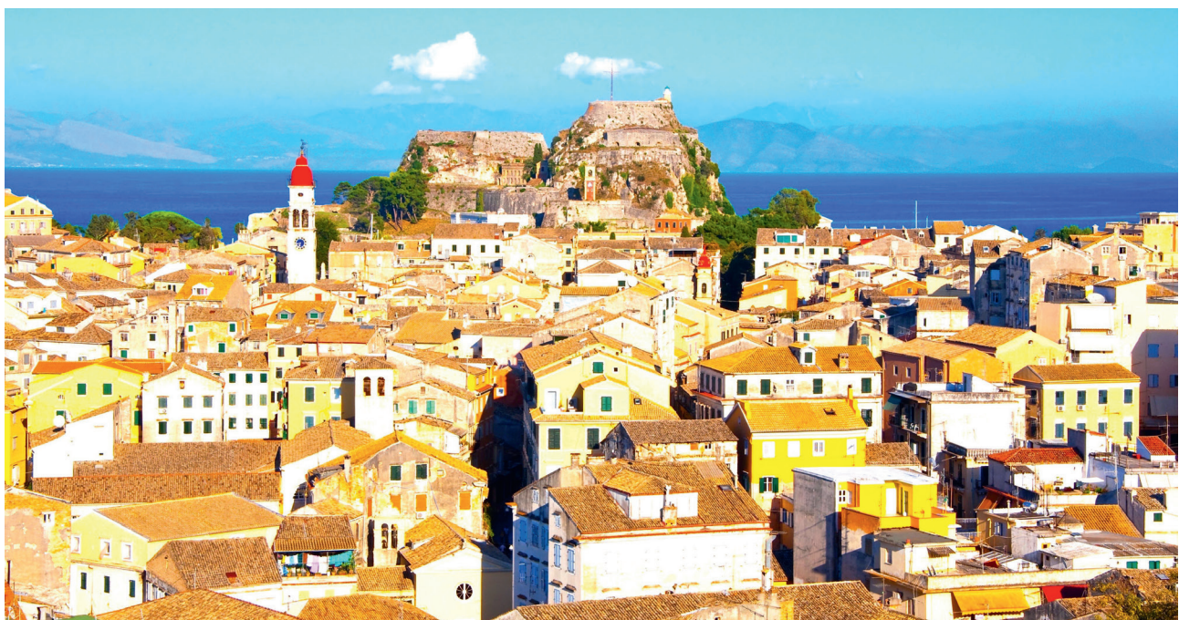
The picturesque town of Corfu.

Since ancient times, Corfu has been known as a place of beauty, culture and hospitality. In his 'Argonautics' Appolonius of Rhodes mentioned that Jason and the Argonauts took refuge in Corfu to evade the pursuing Colchs. In 'The Odyssey' Homer