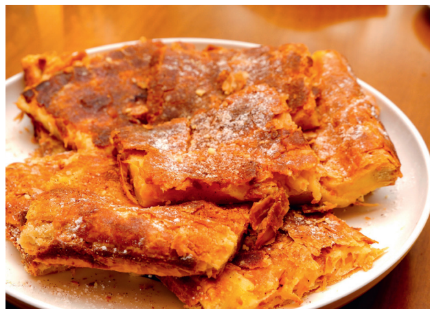
The sweet and creamy Bougatsa.

Bougatsa is the country's most popular breakfast pastry, made of homemade custard between layers of filo pastry. In every bakery on the island you will find a warm Bougatsa. In most bakeries you will be offered the savoury version of the pastry as well. You can find the Bougatsa where in place of custard, the pie will be filled with cheese or minced meat.