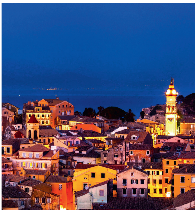
Vibrant Corfu town at night.

The island's attractions to tourists was already evident by the turn of the century. It was on the lists of those who embarked upon the 'Grand Tour'