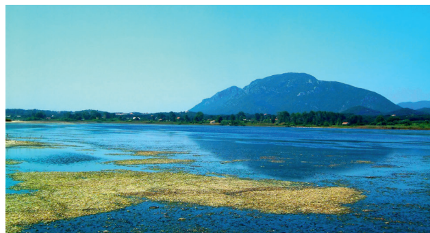
Korissia lake next to the beach.