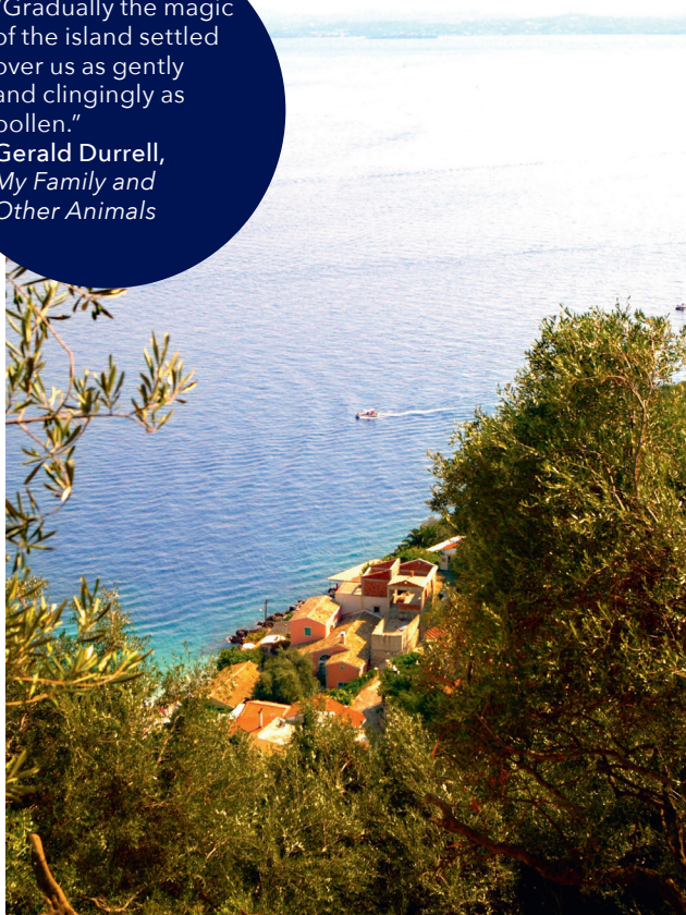
The beautiful village of Kaminaki.

Gerald Durrell, My Family and Other Animals