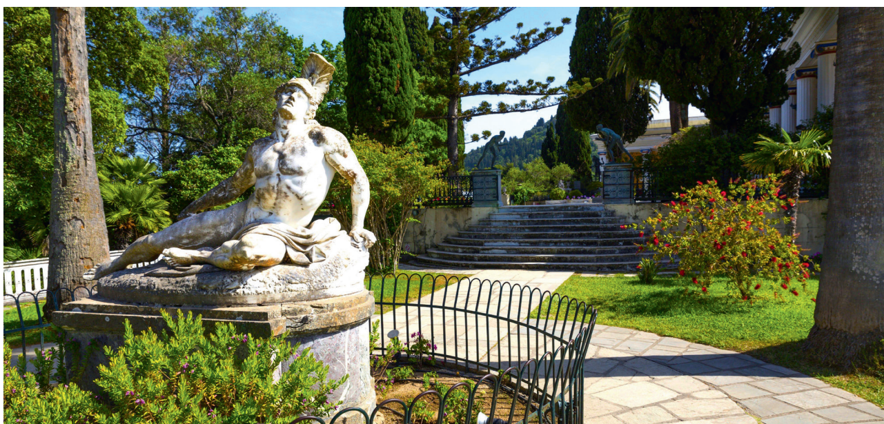
Statue of Achilles in the gardens of the palace.