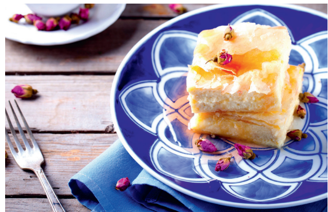
A delicious Greek version of the French mille-feuille.

For the majority of Greeks, Galaktoboureko is the tastiest sweet in the country. Made of home made pastry and custard filling with eggs, milk and sugar, Galaktoboureko resembles the French mille-feuille. Unlike the French delicacy though, in this instance, the custard is baked with the pastry.