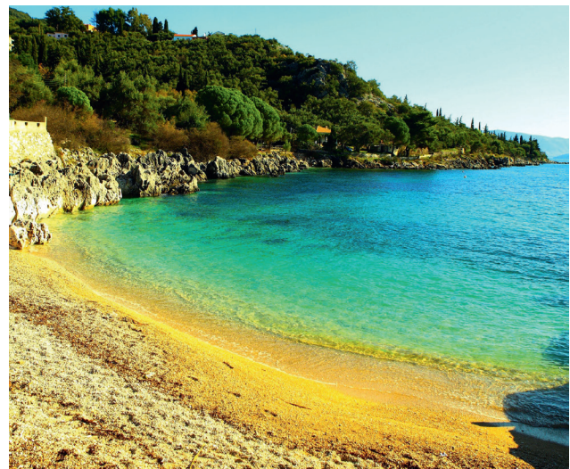
The small but delightful beach at Nissaki.

Bordering with Corfu town, Kanoni is where you will find the much photographed monastery of Vlacherna and Pontikonissi (Mouse island). What the pictures don't show you is that these are immediately next to the airport runway. Nonetheless, it is a beautiful spot with a little boat making trips across to the island with its tiny church.