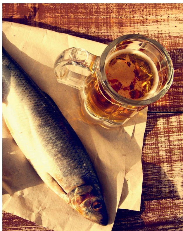
The refreshing Corfu beer.

Corfu's breweries are known to produce some of the finest beers in the country. Corfu beer is the perfect complement to your summer holidays, especially if you fancy a well-brewed ale.