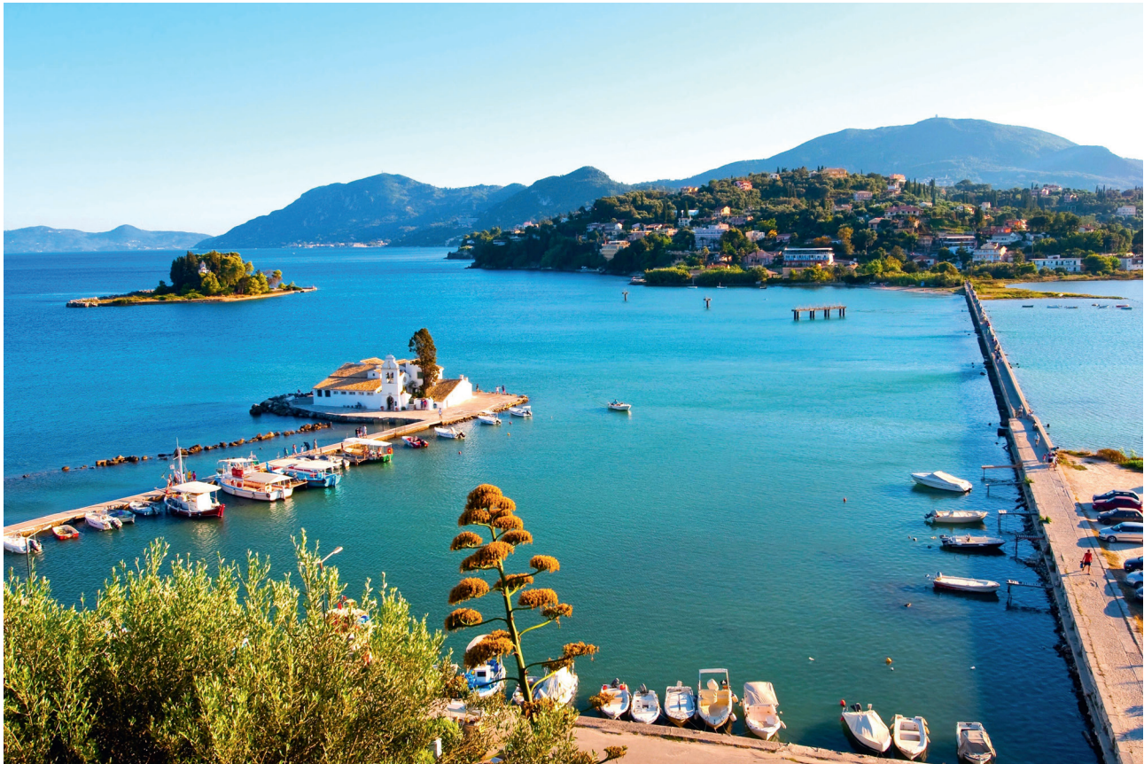
Pontikonisi as seen from the hilltop in Kanoni.

Kaiser Wilhelm even built his famous 'Throne' – a small viewing tower on top of this wooded mountain – so that he could admire the dramatic western coastline and its stupendous sunsets.