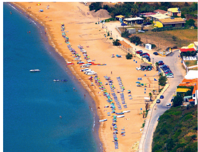
Agios Georgios beach.

Ermones, in the west coast, has a fantastic beach with a number of facilities available. There is even an 18-hole golf course nearby.