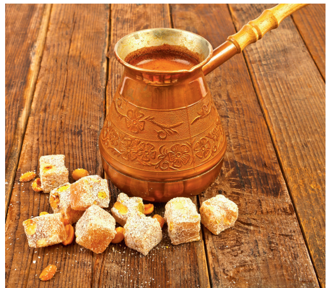
Greek coffee in a pot.

There are lovers and there are haters. People who have tried the Greek coffee, also known as Turkish - although you are better off ordering it as 'Greek' - have either fallen in love with its strong coffee smell and thick texture or have found it hard to even get a sip off the cup. Order this unfiltered coffee with a spoon of sugar, otherwise you will be joining the haters in no time.