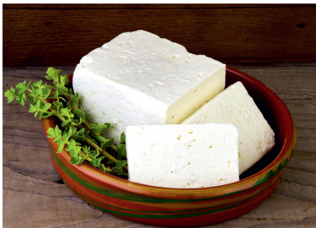
A refreshing block of Feta.

Made of sheep's and goat's milk and produced in blocks, feta is the most popular Greek cheese used in lots of Greek dishes, salads and even pastries. High quality feta should have the aroma of ewe's milk, yoghurt and butter, together with a smooth and thick texture.