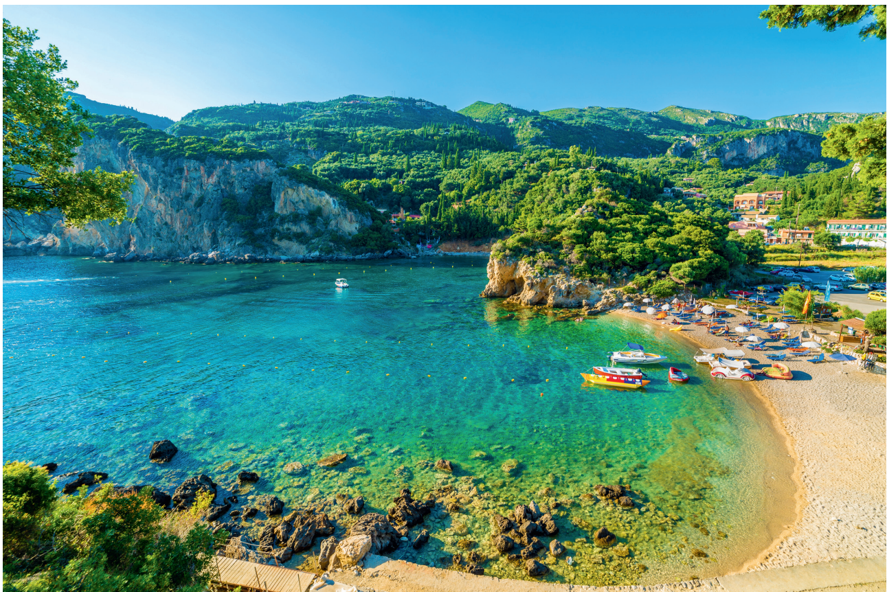
The beach at Paleokastritsa, Corfu.

Should you book two holidays with us in the same season at full brochure price, we will reduce the cost of your second holiday by 15%.