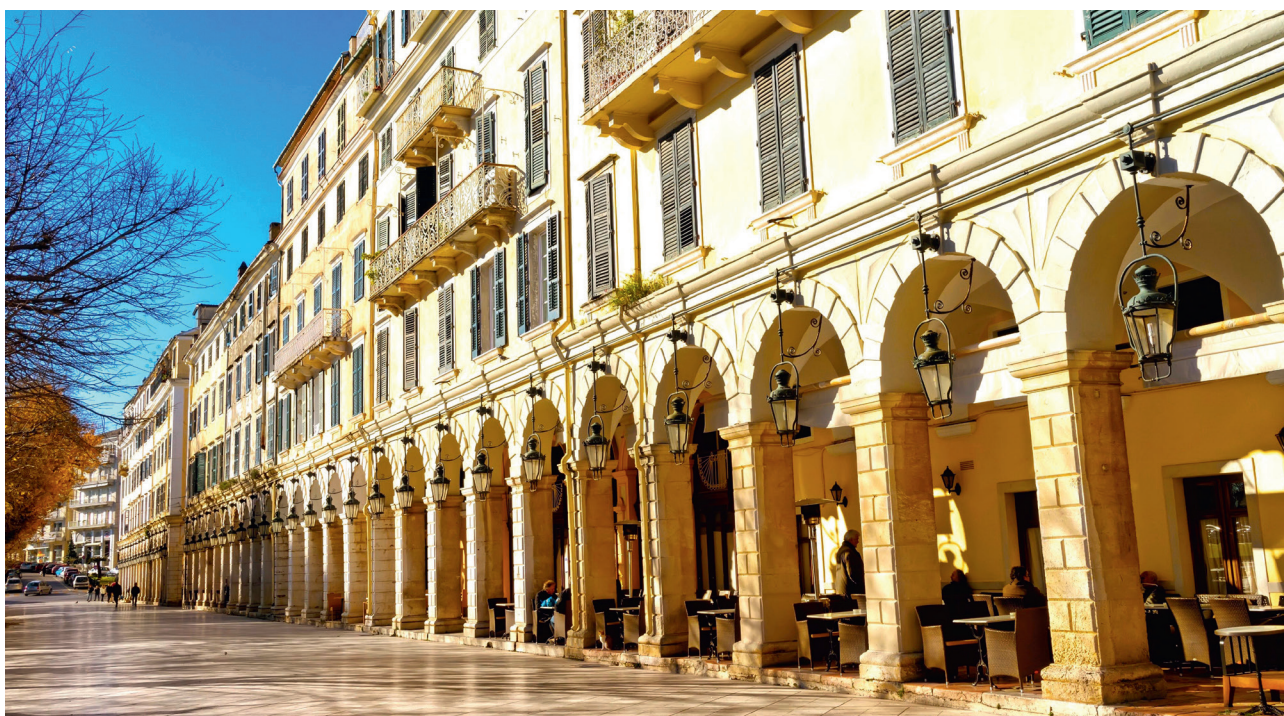
Liston might remind you of Rue de Rivoli in Paris.