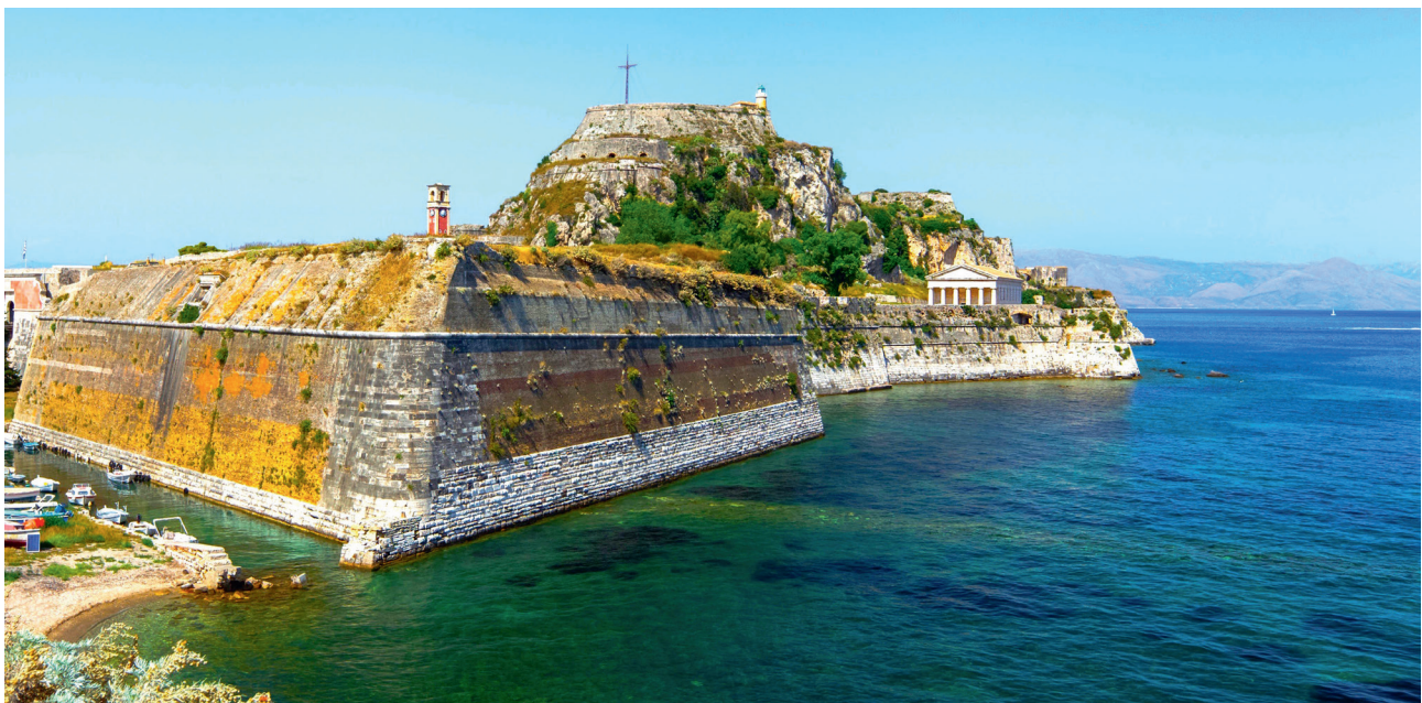
The Old Fort in Corfu town.

Situated just south of Corfu town on the main road to Benitses, the Achilleion Palace is an impressive house open to the public daily and thus attracting a number of coach tours throughout the day. Don't let that put you off however, as the palace is definitely worth a visit. Dating back to 1890, it is home to a number of portraits, jewellery, displays and personal effects of Elizabeth, Empress of Austria. She originally had the house built as a summer retreat and named it after Achilles, reflecting her passion for Greek literature and mythology. She would visit every summer until