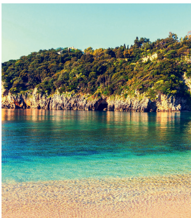
Beautiful scenery in Kassiope.