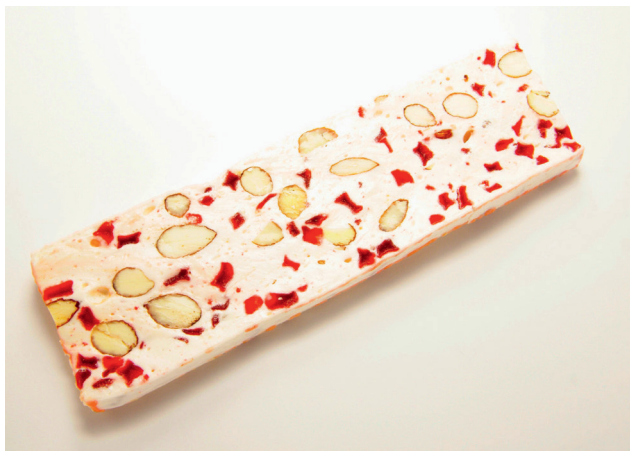
The greek nougat, known as Mandoles or Mandolato.

Mandoles is a sweet snack famous in the Ionian, made of almonds and sugar. Inspired by the famous Italian nougat, you can buy Mandoles either by the kilo or packed.