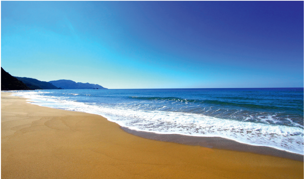
The golden sandy beach of Glyfada.

can be seen. On its seaward side is the long and almost deserted Halikouna Beach, with its small taverna. It is a gorgeous stretch of sand backed by wind-blown dunes.