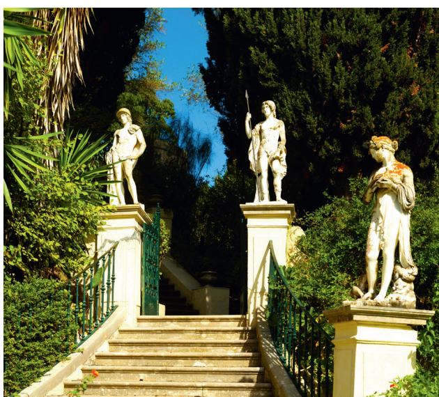
One of the many entrances to the palace.

her assassination in 1898 by an Italian anarchist. Elizabeth was the muchloved queen of Hungary and the Empress of Austria, whose tragic life is well documented and was even made into a film in Austria, 'Sissi' (her nickname), in the 1950s. After her death, the palace was abandoned for a while and then taken over and used as a hospital toward the end of 1919, during which time some of the original artwork, furnishings, and interior were damaged. Fortunately, however, most survived and in 1962 the palace became part of the Greek National Tourist Organisation. It is open from 9.00am – 7.00pm.