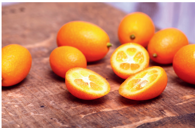
You will also find Kumquat marmalades.