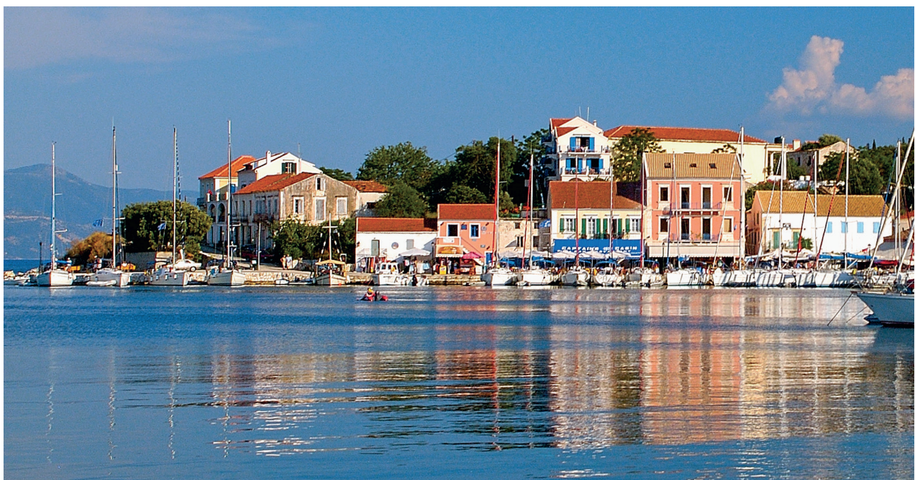
Our home in Fiskardo, Kefalonia.

We believe that people who book with Ionian Island Holidays will benefit from our experience, knowledge and the personal attention that we, as a small independent tour operator, can offer. When you contact our office in London, you will be speaking to an experienced and knowledgeable team who know the islands and the accommodation intimately.