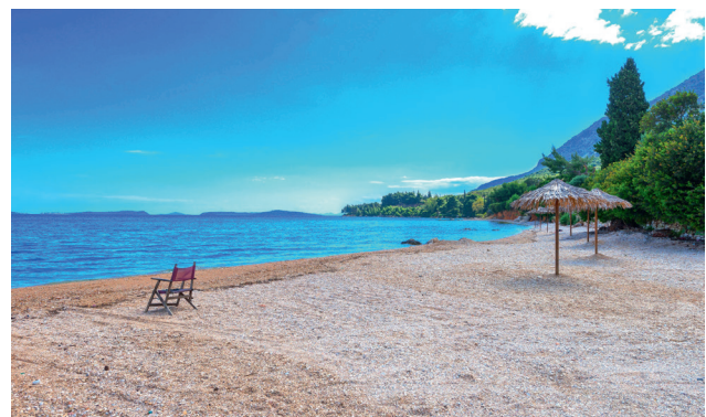
Agios Ioannis beach.

when he got back to Ithaka from his 10 year long journey. Just off Vathy, at 2km from the capital and on your way to Aetos, you will enjoy a blend of sand and pebbles giving to clear blue waters and natural shade from the trees surrounding the beach. Dexia also has a lifeguard as well as a beach bar.