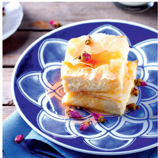
The very fine Aliada dish.

For the majority of Greeks, Galaktoboureko is the tastiest sweet in the country. Made of home made pastry and custard filling with eggs, milk and sugar, Galaktoboureko resembles the French mille-feuille. Unlike the French delicacy though, in this instance, the custard is baked with the pastry.