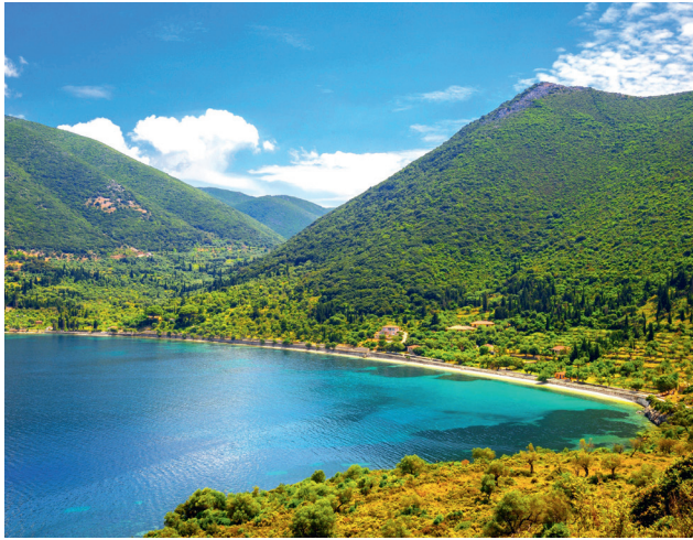
Mythical and green Ithaka.

kafenion, next to the Venetian bell tower will supply you with a key. The kafenion is also worth a visit barely having changed in a hundred years. This completely authentic meeting place was chosen as the model for the kafenion in the recent film of Captain Corelli's Mandolin.