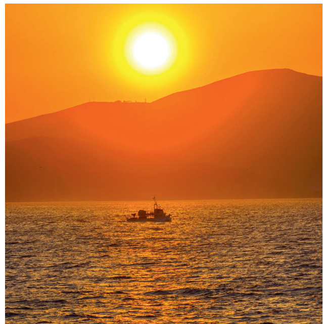
Sunset in Ithaka.

Nightlife on the island revolves around the plateias or squares. Every village has one and throughout the summer a series of religious festivals are celebrated. These all night affairs, where the wine flows freely and songs and traditional dancing are enjoyed by the whole community, young and old, should not be missed. These "Panagiria" are not contrived tourist occasions full of Zorba wannabes and plate smashing, but merely the Greeks doing what they do best, providing hospitality and enjoying themselves! Ithaka is neither a 'grand' nor 'in' holiday destination, at least in the context of the trade writers' world of hyperbole and fashion, nor is it a small island lost in time and obsessed with an ancient myth. It has taken on board the trappings of everyday life in modern Europe, ATMs, internet cafes, satellite television, good communications and last but not least, modern plumbing! New cars are readily available to hire, road surfaces have been improved, restaurants and shops modernised, air conditioning and swimming pools have been installed, but in the process has not lost sight of its soul. It is an island where a holiday can easily become a way of life!