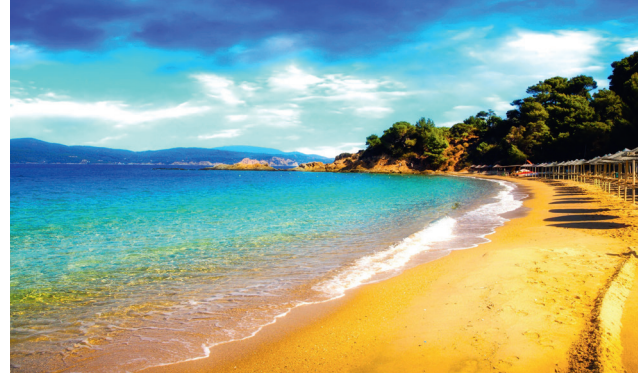
The exotic Banana beach.