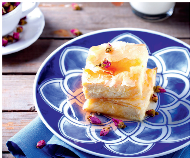
The very fine Aliada dish.

For the majority of Greeks, Galaktoboureko is the tastiest sweet in the country. Made of home made pastry and custard filling with eggs, milk and sugar, Galaktoboureko resembles the French mille-feuille. Unlike the French delicacy though, in this instance, the custard is baked with the pastry.