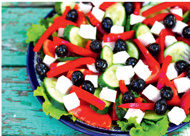
Greek salad – a healthy choice.

During the hot summer days, you can't go wrong with a refreshing Greek salad. You can even have it as your main course. Why not throw some grilled meat on the side?