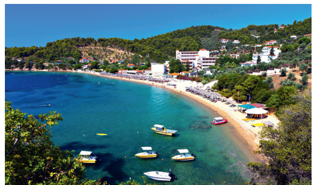
View of Achladies beach.

Situated 2km from the capital, this sandy beach is situated in a small cove. It is fully equipped with sunbeds, parasols and a cantina/taverna. Its clear waters are suitable for all kinds of water sports: windsurfs and water skis can even be rented here. It is reachable on foot, by car, by local bus, or by boat leaving regularly from Skiathos town.