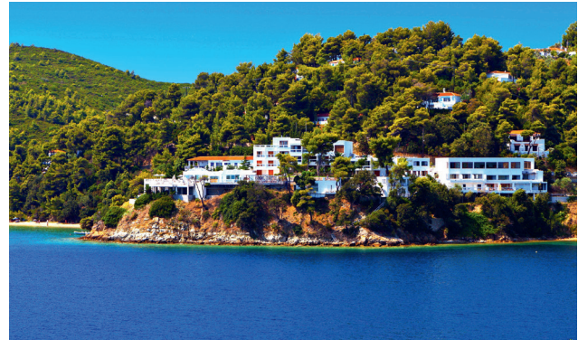
Kanapitsa village is also near Katsarou.

During the day it is busy with the hustle and bustle of the locals, their fishing boats and the arrival of numerous ferries. At night the whole area is transformed into an array of waterfront restaurants and cafés welcoming locals and visitors alike.