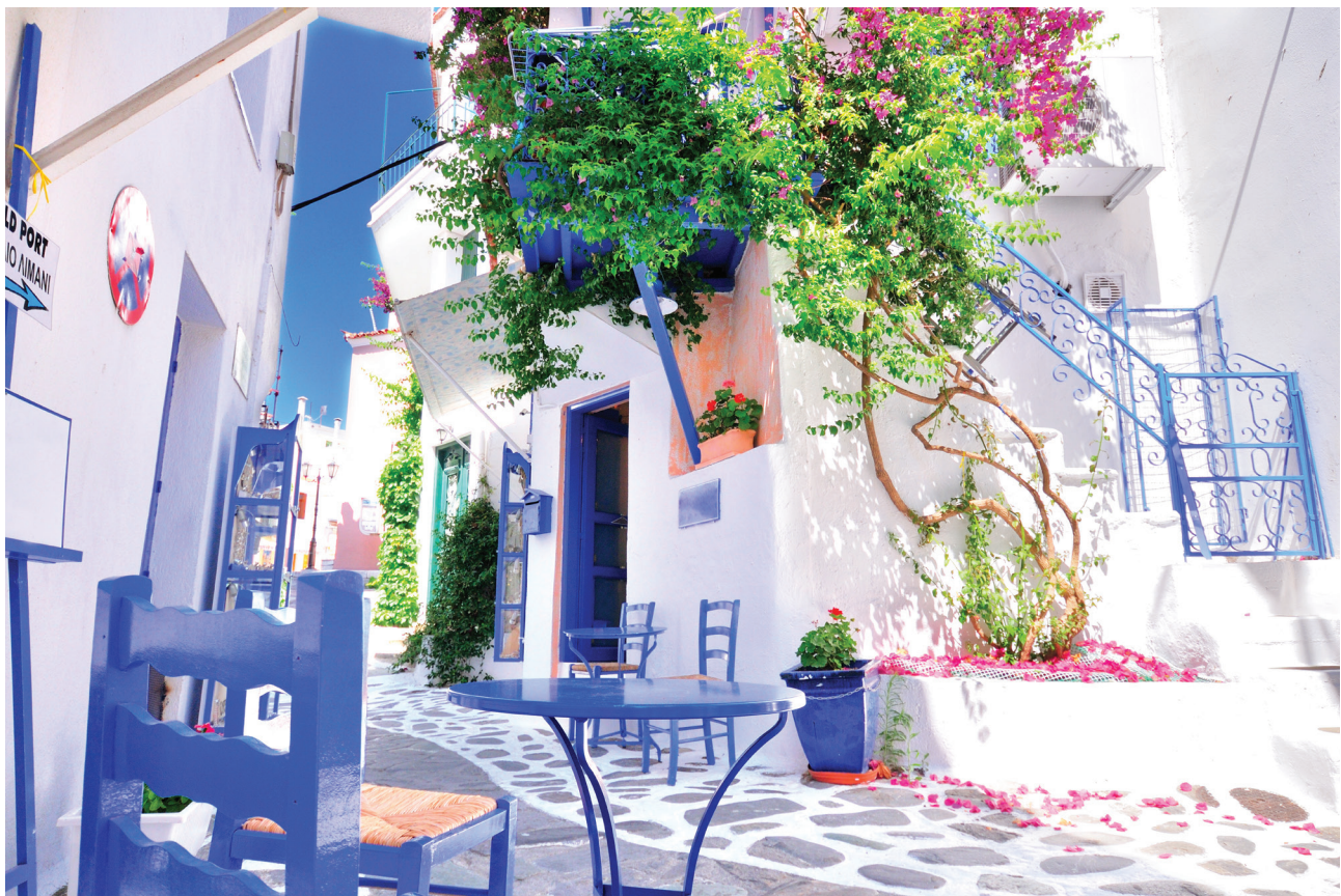
A traditional village in Skiathos.

Should you book two holidays with us in the same season at full brochure price, we will reduce the cost of your second holiday by 15%.