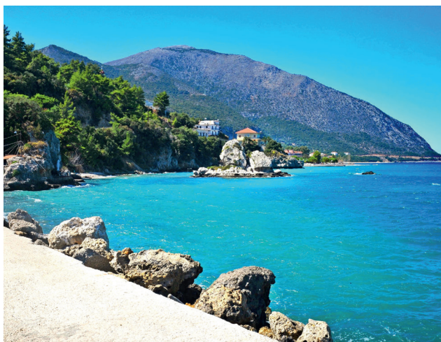
The port city of Poros.

wash house and spring, bell tower graveyard and olive press. The resort has a very popular sandy beach which is particularly good for water sports, but not good for those wishing to escape the crowds. Further along the beach a breeding sanctuary for the endangered sea turtles native to the area can be found.