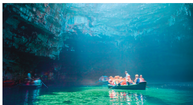
Stunning view of the lake.

Kefalonia has an impressive underground water network with subterranean lakes and caverns. Formed over the course of millions of years, Drogarati Caves are an understandably popular tourist attraction on the island. The cave's stalagmites and stalactites are illuminated and visitors enjoy a captivating view full of colours and shapes. The stunning underground lake beneath the Melissa Caves, four miles from Sami, is another 'blockbuster' tourist attraction. The sunlight together with the stalactites create beautiful colour combinations no to be missed, especially if its your first time on the island.