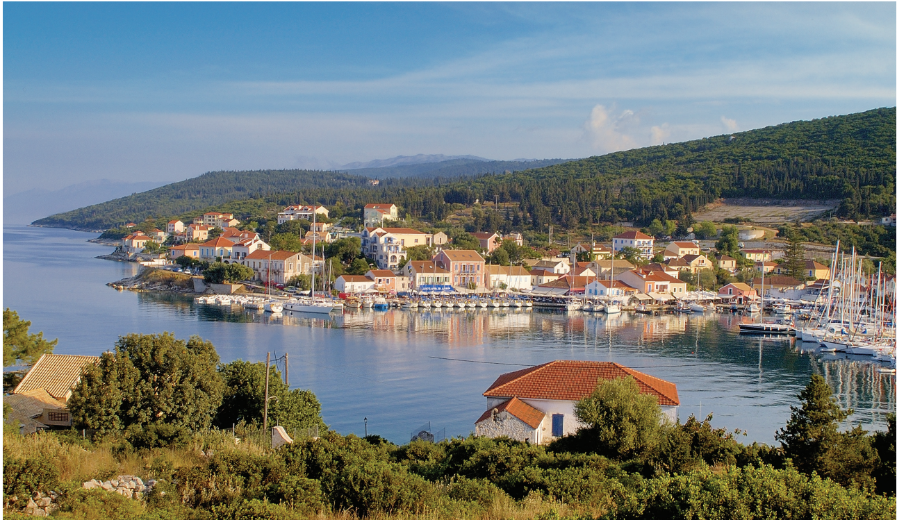
View of Fiskardo.

Northern Kefalonia remains almost completely untainted by tourism and happily for us strict planning laws prevent the picturesque towns of Fiskardo and Assos from being overdeveloped. The majority of the hustle and bustle in Fiskardo comes from the vast array of boats that stream in and out of the harbour throughout the season. With a combination of sailing flotillas, daily ferries and some of the finest quality yachts in Europe the people-watching potential is endless and many an hour can be spent in the harbour-front tavernas watching the world go by.