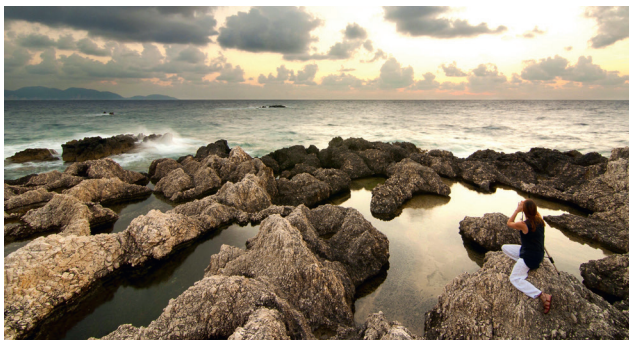
During a winter day in Alaties.

Beaches to visit are Alaties ("Salt pans") and nearby Agios Jerusalem (St Jerusalem). Alaties is a unique cove which takes its name from the small salt pools that gather along the beach – which is actually still collected by locals today and used for cooking. The beach is famed in the area and in past years was frequented by locals who would visit the beach for its medicinal qualities. Local people would sit in the pools of hot water that had gathered on the beach, to relieve various ailments such as rheumatism and arthritis – or simply to enjoy a hot bath! The beach has one taverna open throughout the season.