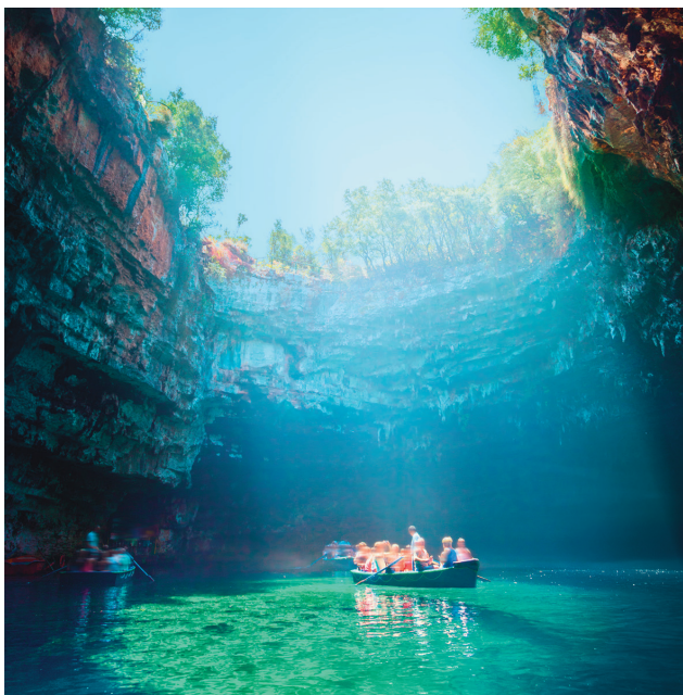
The stunning Melissani lake.

Just two kilometres north of Sami is the village of Karavomylos, where you can find the stunning underground lake beneath the Melissa Caves. Again, as a first time visitor to the island it is worth seeing, the lake is situated in the heart of the caves and due to a collapsed roof directly above, is one of the most visited sights of the island. The water actually comes from the sea at Cape St