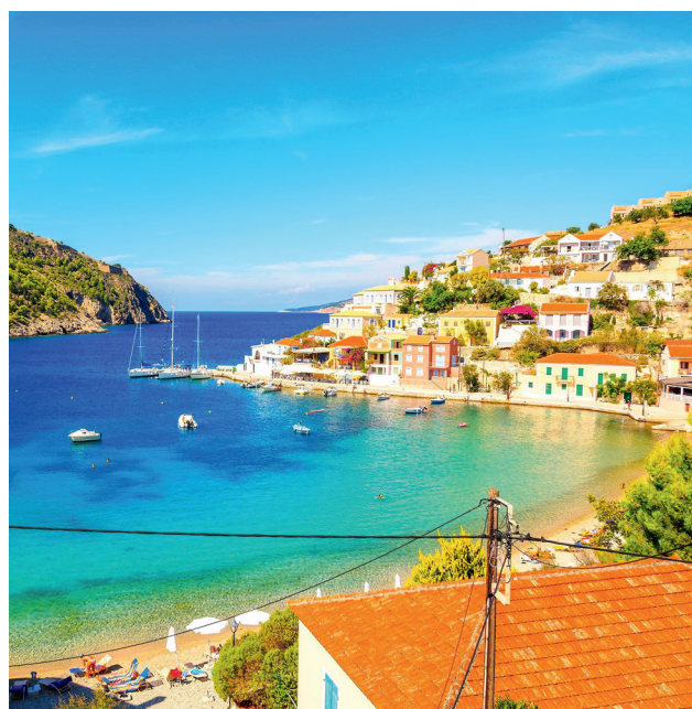
The beautiful village of Assos.

Fortunately in spite of its unique natural beauty, Assos has remained relatively undiscovered and untouched by the main influx of tourism to the island. A handful tavernas can be found in the village with a small selection of shops and a mini-market for everyday needs. There is a short stretch of shingle beach with good swimming in the harbour and caves to explore at the other side of the bay.