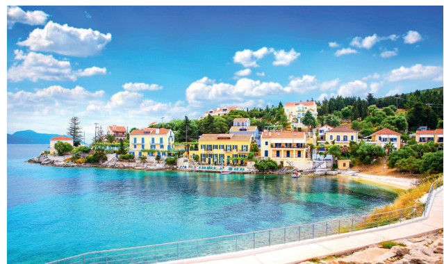
View of Fiskardo.

You can hire motorboats here and explore most of the Ithaka Channel – even go across to Ithaka if you want. There are diving courses and a marine adventure trip as well as cruises around the islands. The boats leave every morning and stop at various beaches and harbours on the way, – some even go to the big sea caves on Meganisi, which are said to have been used to hide submarines during the war. If you're into walking, there is a series of trails and tracks to follow. You could even buy a rod and line and catch your supper off the rocks around the harbour! There is a daily ferry to Lefkada and Ithaka.