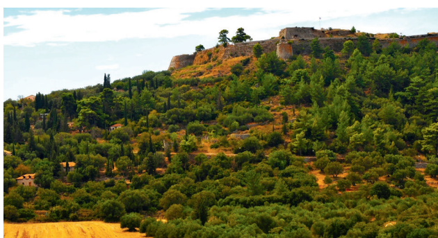
Agios Georgios castle.