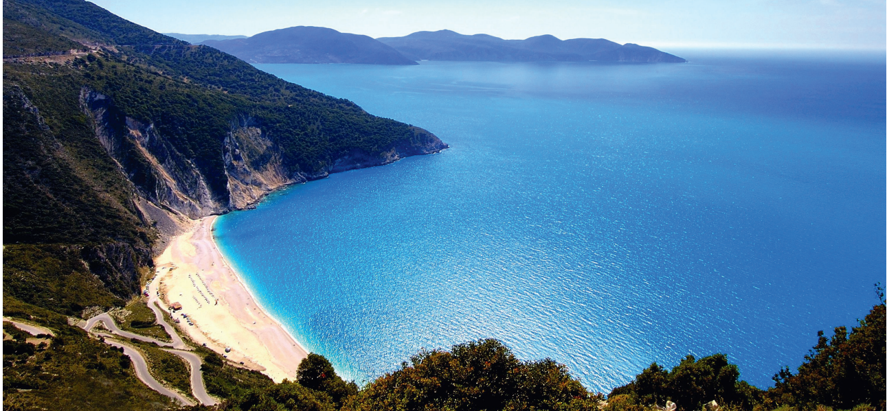
Greece's best beach – Myrtos.