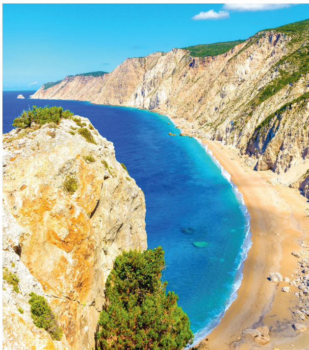
Clear blue water at Ammes beach.

Six miles from Argostoli, the beautiful Ammes beach is a perfect spot to watch the sunset. With its gorgeous shallow clear waters and dark golden sand, it is a safe beach making it ideal for families.