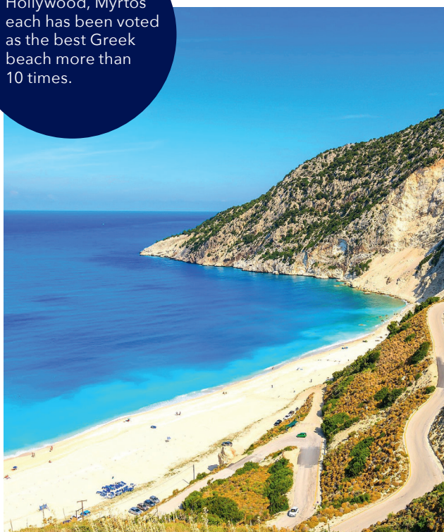
Panoramic view of the majestic Myrtos beach.

Straight out of Hollywood, Myrtos each has been voted as the best Greek beach more than 10 times.