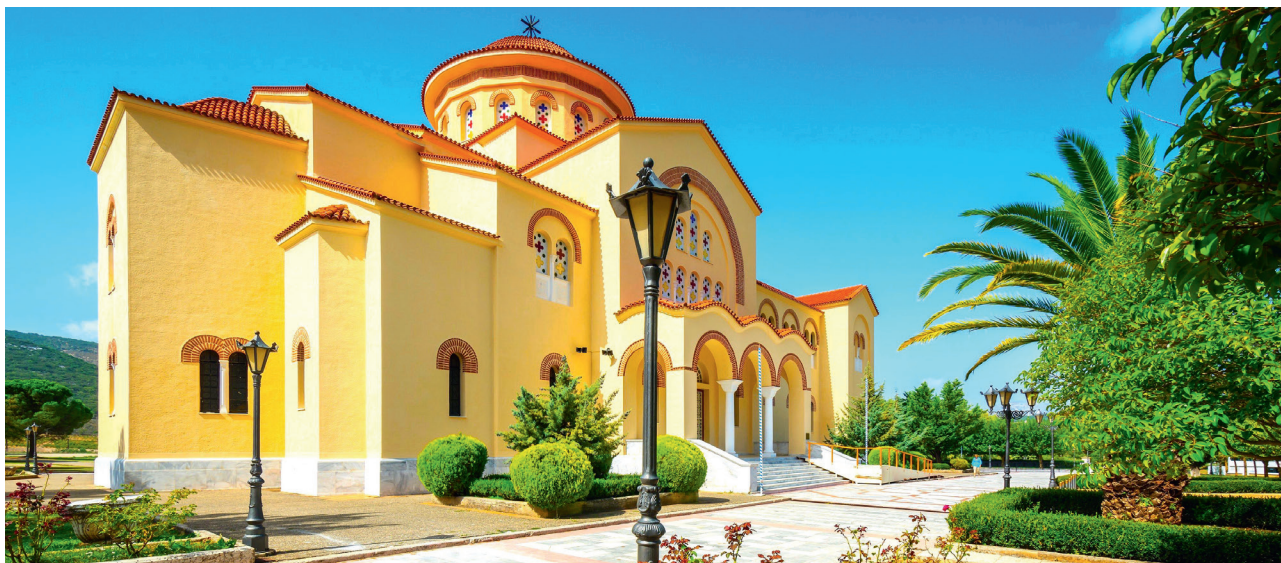
The monastery of Agios Gerasimos.