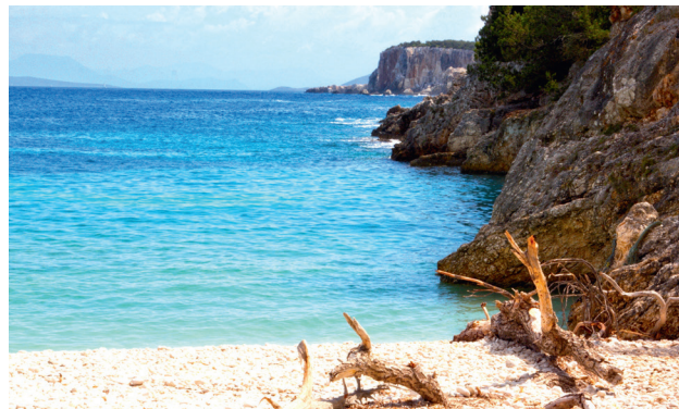
The mesmerising Dafnoudi beach.