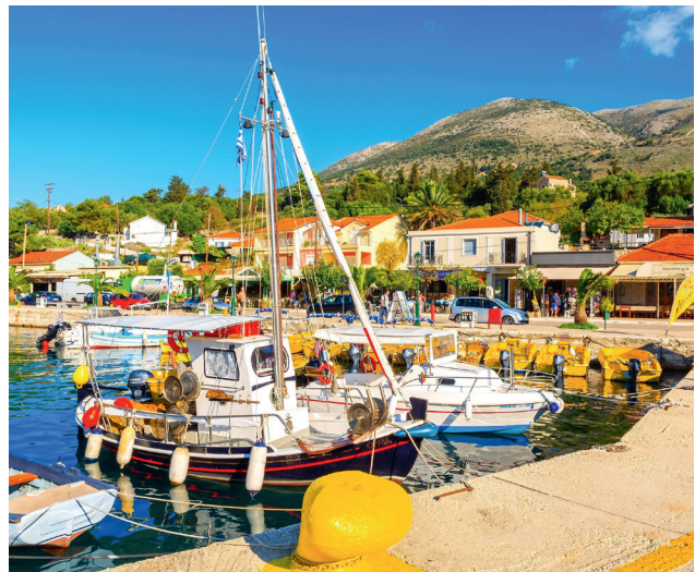
The port of Agia Efimia.

Theodoron near Argostoli on the other side of the island. If you go to the main platia in Karavomylos, there's another small lake beside the sea with a water wheel and a good taverna. Karavomylos means Boatmill in Greek. There's a good shop for postcards, ice creams etc. To enter the cave, twenty steps lead down from the entrance to a landing platform where boats can be taken on a small guided tour inside which is certainly worth taking. The tour lasts ten minutes – a small fee is charged throughout the summer.