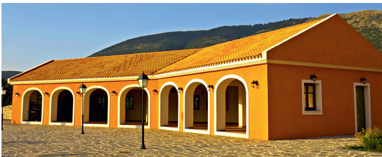
The Robola winery, next to the monastery.

In 1982, the experienced winemakers of Robola, established the Robola Cooperative of Kefalonia in an effort to promote the calibre and potential of the Kefalonian vineyards and to ensure a steady income for themselves. A year later, the first grape concentration was bottled and brought into the market, marking Robola's first move to commercialisation. Today, the Cooperative is 300-strong and with its own winery factory is now based in the community of Omala, right next to the Monastery of Agios Gerasimos.