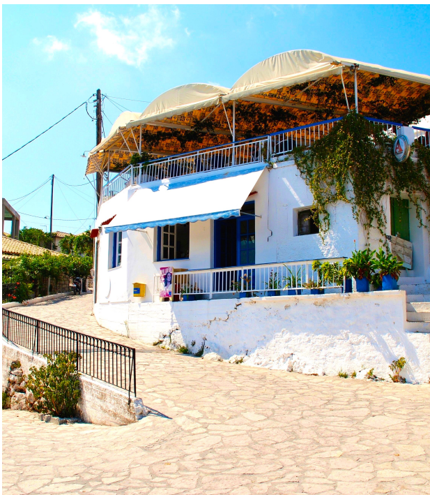
The village of Spartochori

The village has remained unchanged for many years, having only gained electricity in 1973, and until recent years the village had just two cars which served all of the inhabitants! Certainly not much has changed since then, as the roads are extremely narrow and much skill is required to maneuver anything more than a moped around the twisting roads and alleyways of the village. It is much easier and probably more enjoyable to explore on foot, as tourism has done little to alter the character of this sleepy town - although in addition to the small selection of traditional tavernas and shops there is now one souvenir shop and a pizzeria!