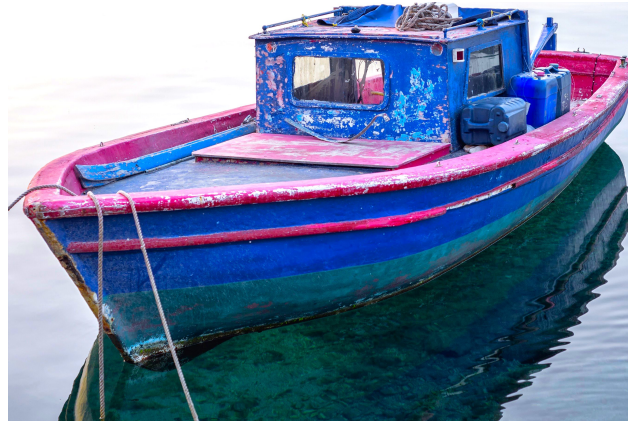
A fishing boat in the nearby Vathi bay

Tucked away behind the port of Spilia and high up on the cliff overlooking the bay on the north of the island, is the pretty village of Spartochori. A few minutes from the port, this village although small, is full of traditional Greek charm and character, with excellent views over the water and out to the islands of Lefkada, Skorpios and Madouri.