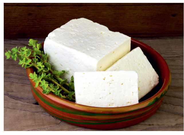
A refreshing block of Feta.

Made of sheep's and goat's milk and produced in blocks, feta is the most popular Greek cheese used in lots of Greek dishes, salads and even pastries. High quality feta should have the aroma of ewe's milk, yoghurt and butter, together with a smooth and thick texture.