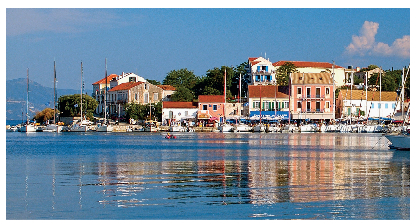
Our home in Fiskardo, Kefalonia.

We believe that people who book with Ionian Island Holidays will benefit from our experience, knowledge and the personal attention that we, as a small independent tour operator, can offer. When you contact our office in London, you will be speaking to an experienced and knowledgeable team who know the islands and the accommodation intimately.