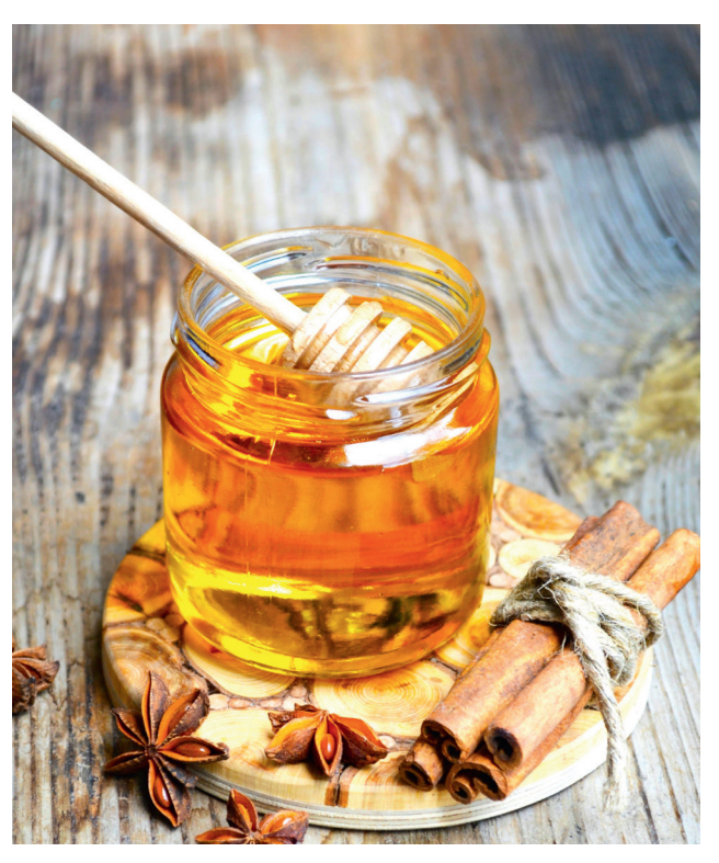
Locally produced honey.

The country produces its own high quality and exceptionally tasty honey. The geography's biodiversity and environmental state promote the yield of such unique produce.