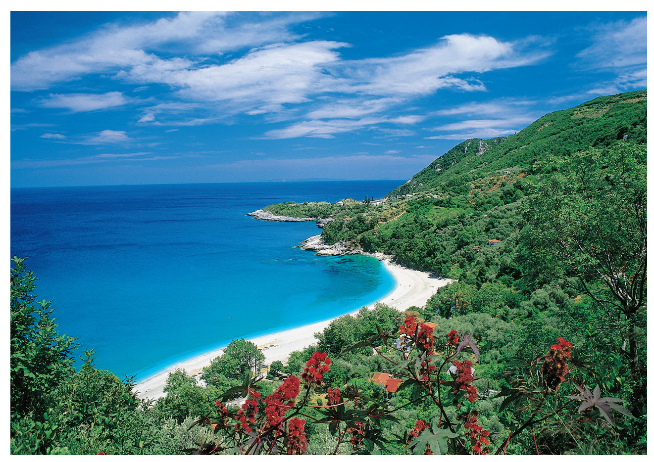
Papa Nero beach.