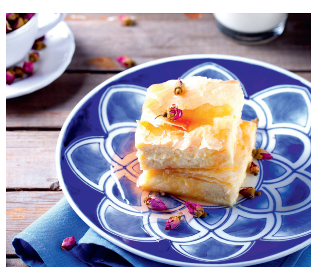
The very fine Aliada dish.

For the majority of Greeks, Galaktoboureko is the tastiest sweet in the country. Made of home made pastry and custard filling with eggs, milk and sugar, Galaktoboureko resembles the French mille-feuille. Unlike the French delicacy though, in this instance, the custard is baked with the pastry.