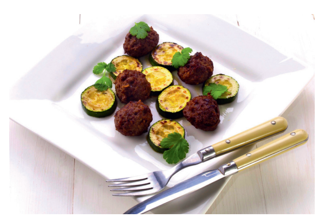
Gourgette balls, known as 'kolokythokeftedes'.

These lightly fried balls are certainly among the most popular starters on the Greek table - usually paired with some freshly made tzatziki.