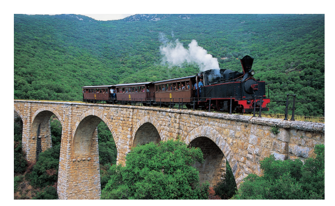
The Pelion train.

The inhabitants of the Pelion, despite a long tradition of independence from the 'mainland', are extremely hospitable and friendly. It is the only region in Greece that remained autonomous throughout the centuries of foreign intervention. Even the usually fearless Ottomans left these mountain villages well alone. Standing on the beach at Mylopotamos, the mouth of a narrow and precipitous ravine, one can easily understand