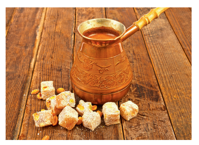
Greek coffee in a pot.

There are lovers and there are haters. People who have tried the Greek coffee, also known as Turkish (although you are better off ordering it as 'Greek') have either fallen in love with its strong coffee smell and thick texture or have found it hard to even get a sip off the cup. Order this unfiltered coffee with a spoon of sugar, otherwise you will be joining the haters in no time.