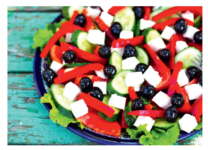
Greek salad - a healthy choice.

During the hot summer days, you can't go wrong with a refreshing Greek salad. You can even have it as your main course. Why not throw some grilled meat on the side?