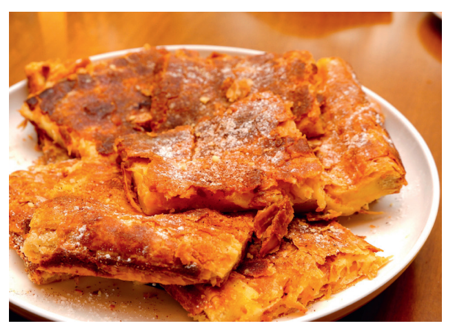
The sweet and creamy Bougatsa.

Bougatsa is the country's most popular breakfast pastry, made of homemade custard between layers of filo pastry. In every bakery on the island you will find a warm Bougatsa. In most bakeries you will be offered the savoury version of the pastry as well. You can find the Bougatsa where in place of custard, the pie will be filled with cheese or minced meat.