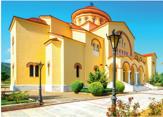
The monastery of Agios Gerasimos.