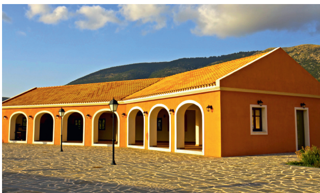
The Robola winery, next to the monastery.

In 1982, the experienced winemakers of Robol a, established the Robola Cooperative of Kefalonia in an effort to promote the calibre and potential of the Kefalonian vineyards and to ensure a steady income for themselves. A year later, the first