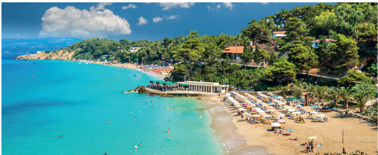
Platis Gialos and Makris Gialos beaches.

Spartia village is located 12km southeast of Argostoli. It is a traditional fishing village with abundant natural beauty that attracts many visitors. The beach of Spartia lies next to its fishing jetty enclosed by a steep limestone cliff known as Hatzoklis. The cliff gives respite to the beach from the afternoon sun as well as the strong winds. If you like to stroll around the beach you will find interesting rocky enclaves and pools in the outcrops nearby. The water is crystal blue and warm. There are also a couple of taverns at the back of the beach.