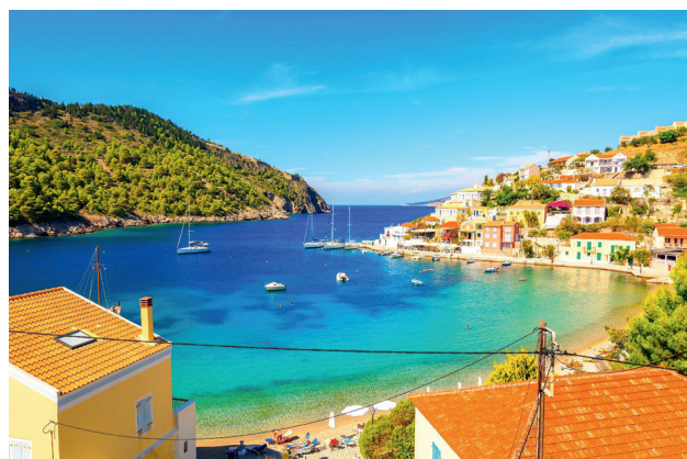
The beautiful village of Assos.

Fortunately in spite of its unique natural beauty, Assos has remained relatively undiscovered and untouched by the main influx of tourism to the island. A handful tavernas can be found in the village with a small selection of shops and a mini-market for everyday needs. There is a short stretch of shingle beach with good swimming in the harbour and caves to explore at the other side of the bay.