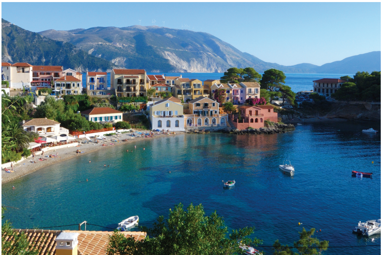
Assos harbour, Kefalonia.

Should you book two holidays with us in the same season at full brochure price, we will reduce the cost of your second holiday by 15%.