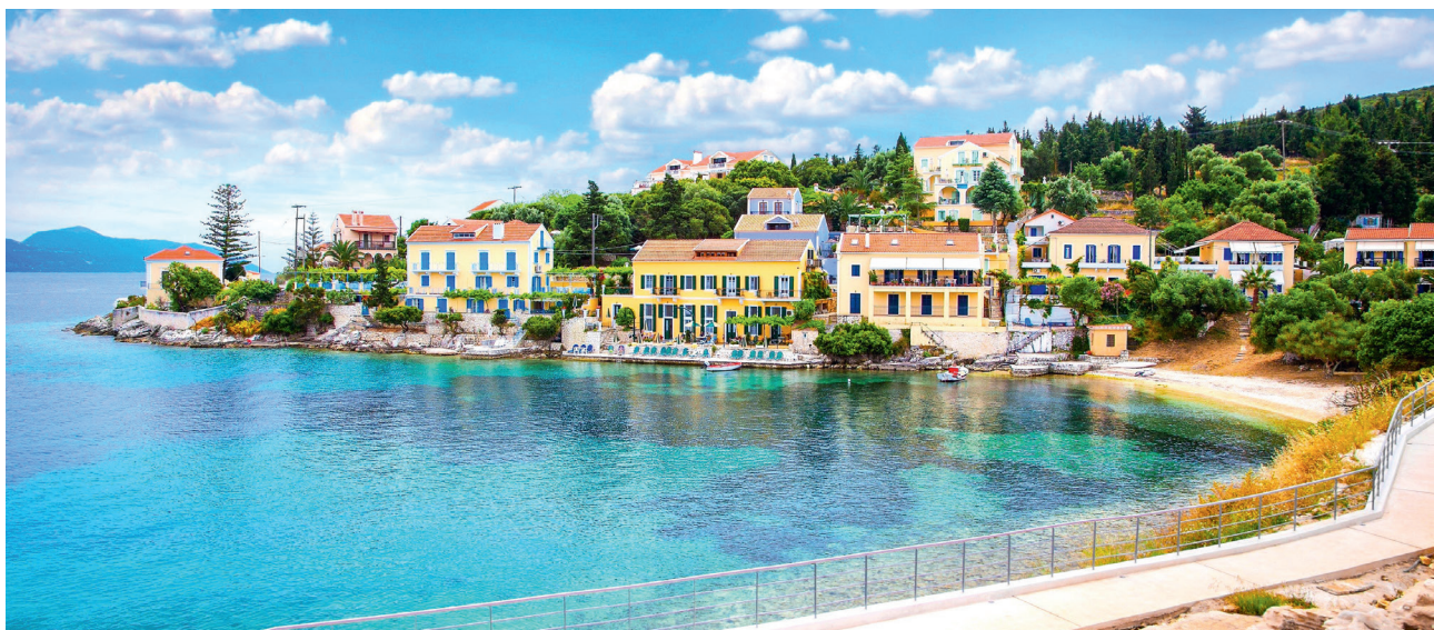
View of Fiskardo.

You can also explore by car the unspoilt mountain villages of the interior, the fertile valley vineyards such as Robola or the high forests of Mt Ainos, then walk the incredible mule track from Assos that climbs the mountain behind. Maybe just stay at home, on balcony or terrace, contemplating the view, thinking about a swim in the pool or whether to eat in at your barbecue or out at a waterside tavern. Kefalonia is the home of Ionian Island Holidays, so we might be just a little biased, but we are glad to be sharing it with you!