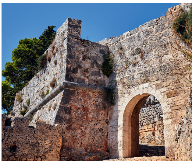
The Venetian Castle of Saint George, Peratata.

The tallest mountain in the Ionian, at five thousand feet, is a national park covered in its unique Greek fir tree, the abies chephalonica. There are plenty of caves that have been thoroughly explored by speleologists over the years, with more than three thousand people living on the slopes of mount Ainos.