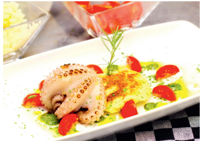
The very fine Aliada dish.

If you enjoy octopus, then Aliada could be just the perfect dish for you. Aliada is a delicious boiled octopus dish put together with garlic and mashed potatoes.