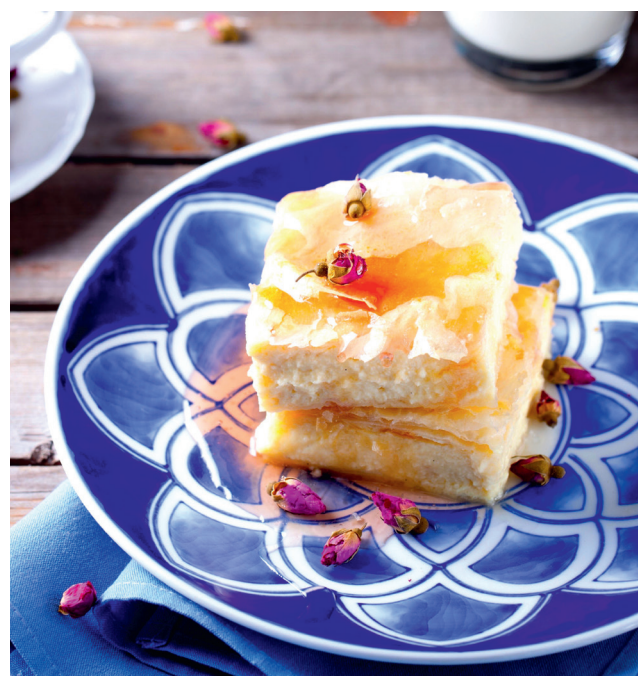
The very fine Aliada dish.

For the majority of Greeks, Galaktoboureko is the tastiest sweet in the country. Made of home made pastry and custard filling with eggs, milk and sugar, Galaktoboureko resembles the French mille-feuille. Unlike the French delicacy though, in this instance, the custard is baked with the pastry.