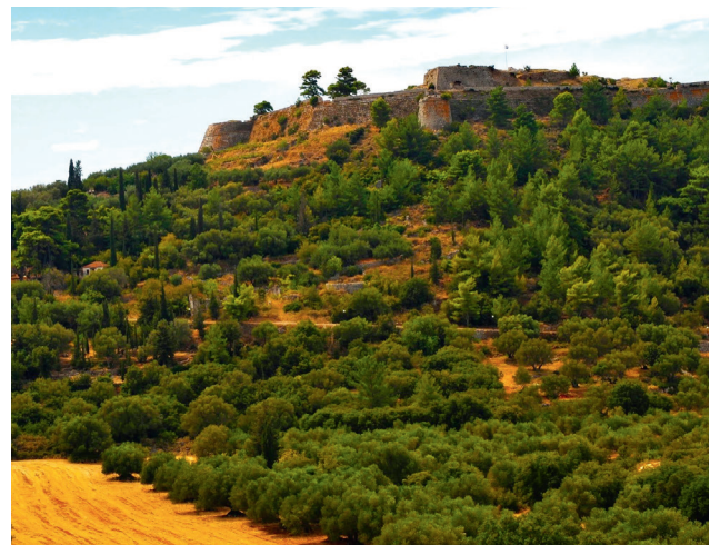
Agios Georgios castle, Kastro.

Built not far from the sea in 1500's by the Venetians, the castle was used as a means to command trade routes. A few years later, the fort fell into the hands of the Byzantines, the Franks and the Turks before the Venetians reclaimed it with the help of the Spanish and the Kefalonians. The people of Kefalonia were impressed by the Venetians' level of craftsmanship and preferred to be ruled by them rather than the Turks. Visitors enjoy the wonderful panoramic view from the castle's bastions. The castle is open usually from 9.00am to 6.30pm with a small entrance fee.