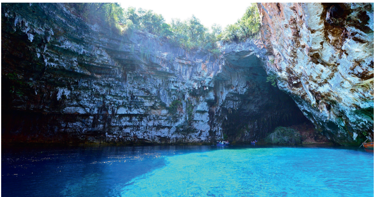
The stunning Melissani lake.