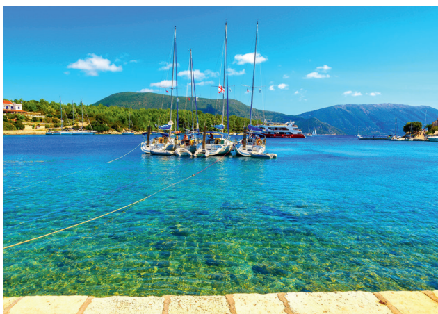
Many sailing boats moor to the dock in Fiskardo.