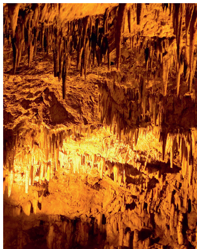
The Drogarati cave stalactites.

Drogarati Cave is an understandably popular tourist attraction on the island and definitely worth a visit if this is your first time to Kefalonia. The underground cave has been formed over the course of 150 million years, although it was only actually discovered last century. The formations of the stalactite and stalagmites are illuminated so that visitors can view their fascinating range of colour and shape. The acoustics inside the cave