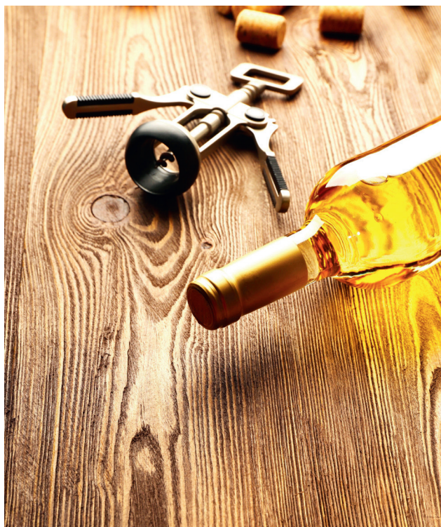
The refreshing and fragrant Robola wine.

The Greek wine grape variety grown in Kefalonia is known for its dry taste and its hint of lemon. Robola is the perfect white wine to complement your summer holidays, especially during those hot Greek days.