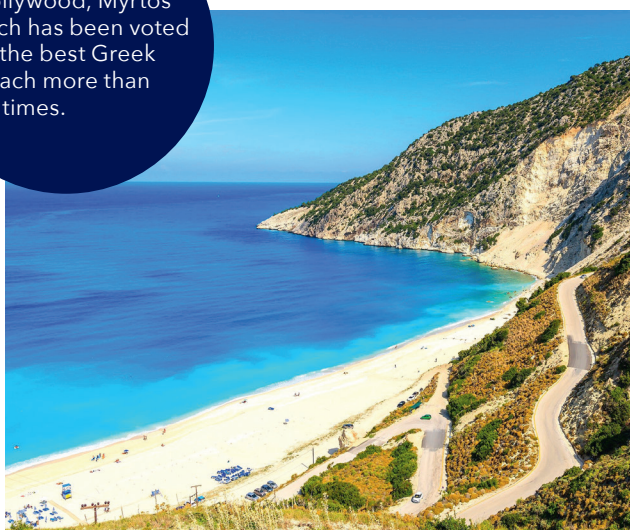
Panoramic view of the majestic Myrtos beach.

Straight out of Hollywood, Myrtos each has been voted as the best Greek beach more than 10 times.