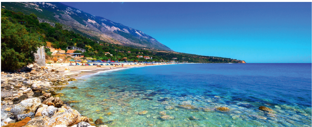
The beautiful beach by the village of Lourdas.

Poros is an attractive harbour town on the south east coast of the island, which like some of the other southern based towns of the island has become slightly more crowded in recent years due to the increase in tourism. With a good choice of waterfront tavernas and restaurants, Poros gives access to Killini on the mainland by ferry, also to the island of Lefkada and is a good stop off point when traveling around Kefalonia. The shingle beach is fairly small and can get crowded in peak season.