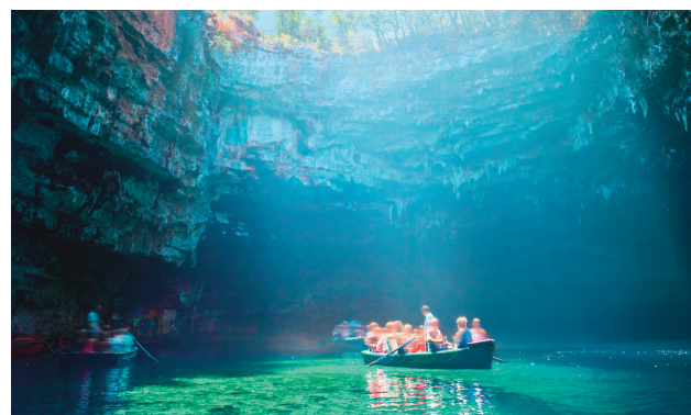
Stunning view of Melissani Lake.