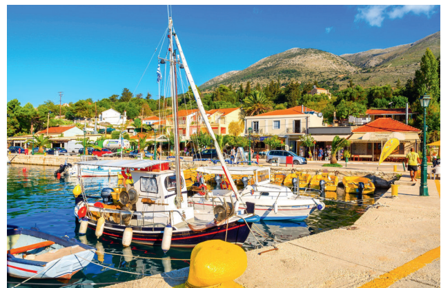
The port of Agia Efimia.

The pretty port of Agia Efimia is located on the east coast. This town was one of the island's most important trading places before the earthquake of 1953, but nowadays is one of the main summer bases for flotilla yachts. Only thirty-five minutes drive from Fiskardo, the town has a small selection of shops and waterside tavernas and a narrow stretch of shingle beach and boasts wonderful views out across the Ithaka channel.