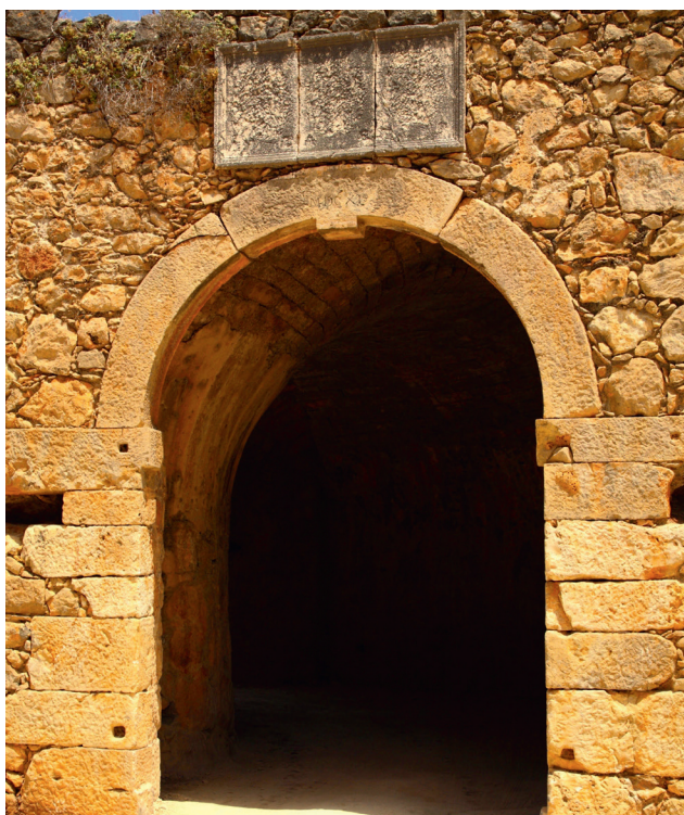
The entrance of the Venetian Fortress, Assos. visitors see the debris of the prison yard and prison cells, with the site being open daily at no charge.