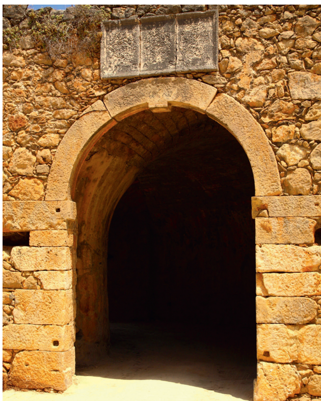
The entrance of the Venetian Fortress.