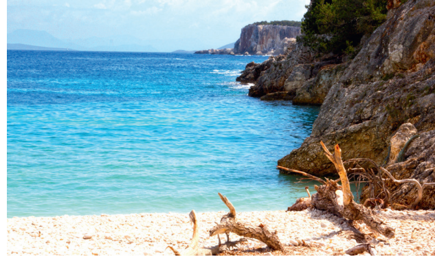
The mesmerising Dafnoudi beach.