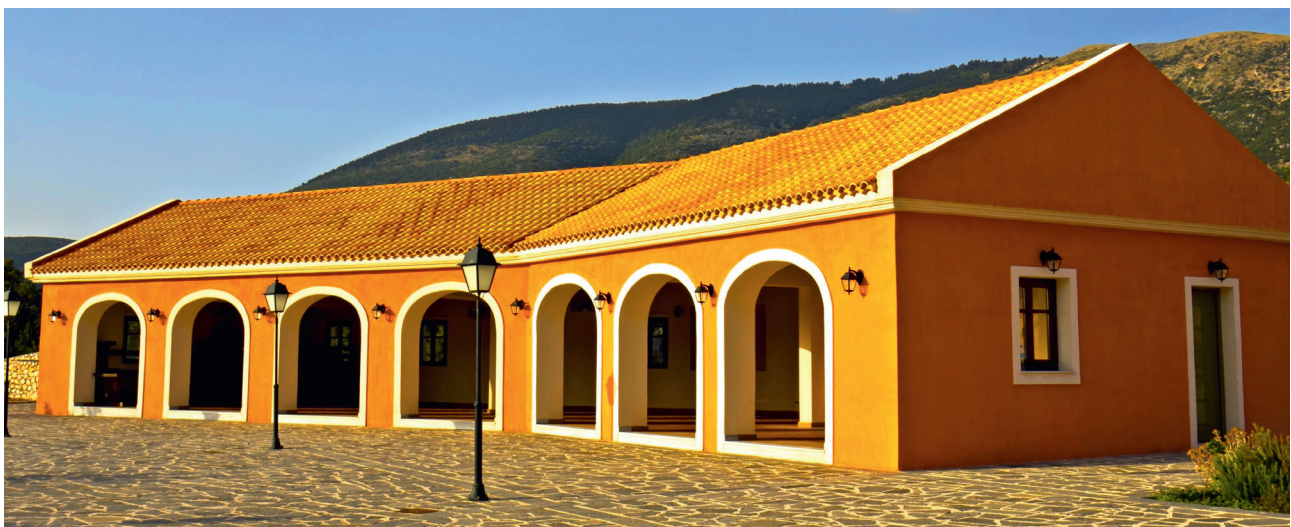
The Robola winery, next to the monastery.

In 1982, the experienced winemakers of Robola, established the Robola Cooperative of Kefalonia in an effort to promote the calibre and potential of the Kefalonian vineyards and to ensure a steady income for themselves. A year later, the first grape concentration was bottled and brought into the market, marking Robola's first move to commercialisation. Today, the Cooperative is 300-strong and with its own winery factory is now based in the community of Omala, right next to the Monastery of Agios Gerasimos.