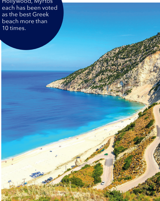
Panoramic view of the majestic Myrtos beach.

Straight out of Hollywood, Myrtos each has been voted as the best Greek beach more than 10 times.