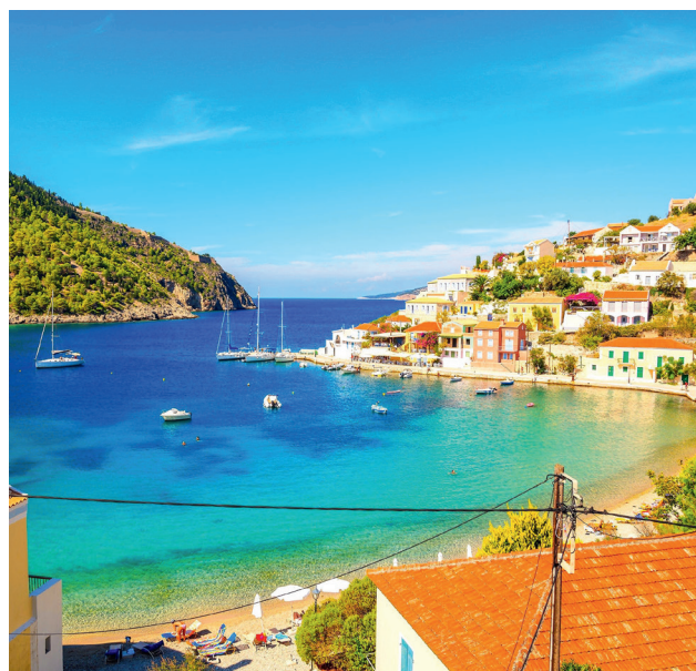
The beautiful village of Assos.

Fortunately in spite of its unique natural beauty, Assos has remained relatively undiscovered and untouched by the main influx of tourism to the island. A handful tavernas can be found in the village with a small selection of shops and a mini-market for everyday needs. There is a short stretch of shingle beach with good swimming in the harbour and caves to explore at the other side of the bay.