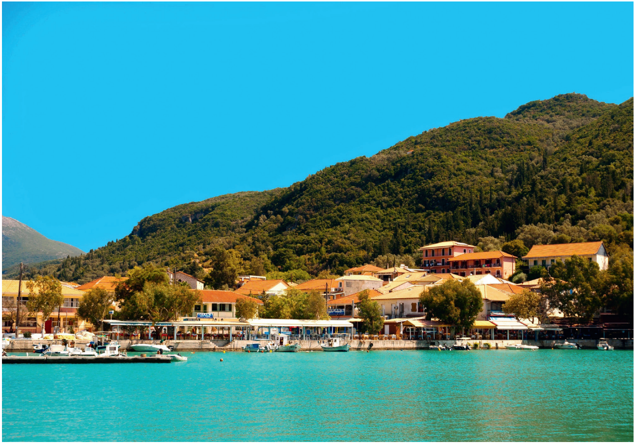
The beautiful village of Vassiliki.

which passes through a small selection of tavernas and shops, although the island's bus service does stop by this beach also.