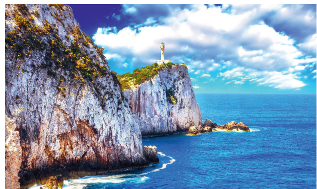
Sappho's leap, Lefkatas.

Located in the south of Lefkada – the most southerly cape on the island – Lefkatas, or else Sappho's Leap, is admittedly a sightseeing highlight. This is the spot where Sappho, the lyric poet, took her life by jumping off the cliff and into the sea. Sappho decided to give an end to her suffering of her unrequited love for Phaona.