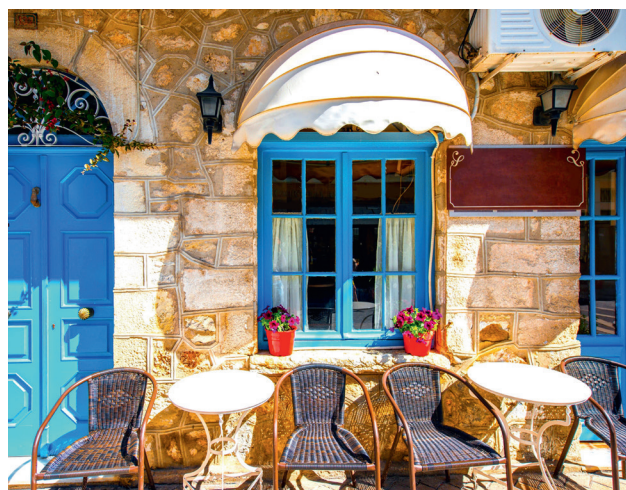
One of the many beautiful spots in Lefkada Town.

The island's summer-long music festival is just one example of the unique nature of Lefkada's cultural appeal. Not only are there also numerous literary works to be found in the impressive library just outside of Lefkada Town, but 25,000 of the works to be found here were actually written in Lefkada. The literary history of the island dates back as far as the poet Sappho who allegedly dramatically took her life from the white cliffs of the southern cape, right up to the writer Lefkadio Hern – a well-