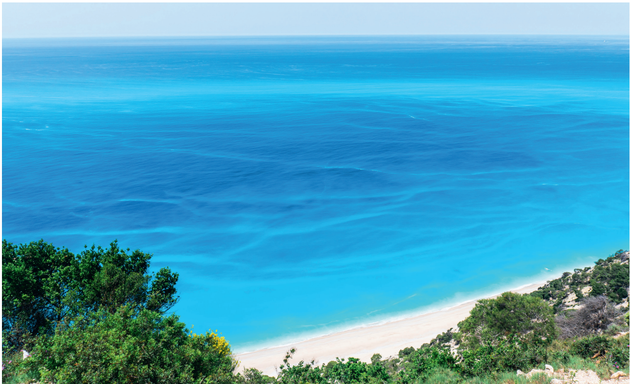
The turquoise water of Egremni beach.

In the summer there is an international festival of traditional music and drama. This festival has been running for almost the last fifty years and different groups travel from all over the world to see it. The festival was originally during a three week period in August, but has now been extended to last from June through to September, with various musical and theatrical events throughout the season. Please ask your rep for further details.