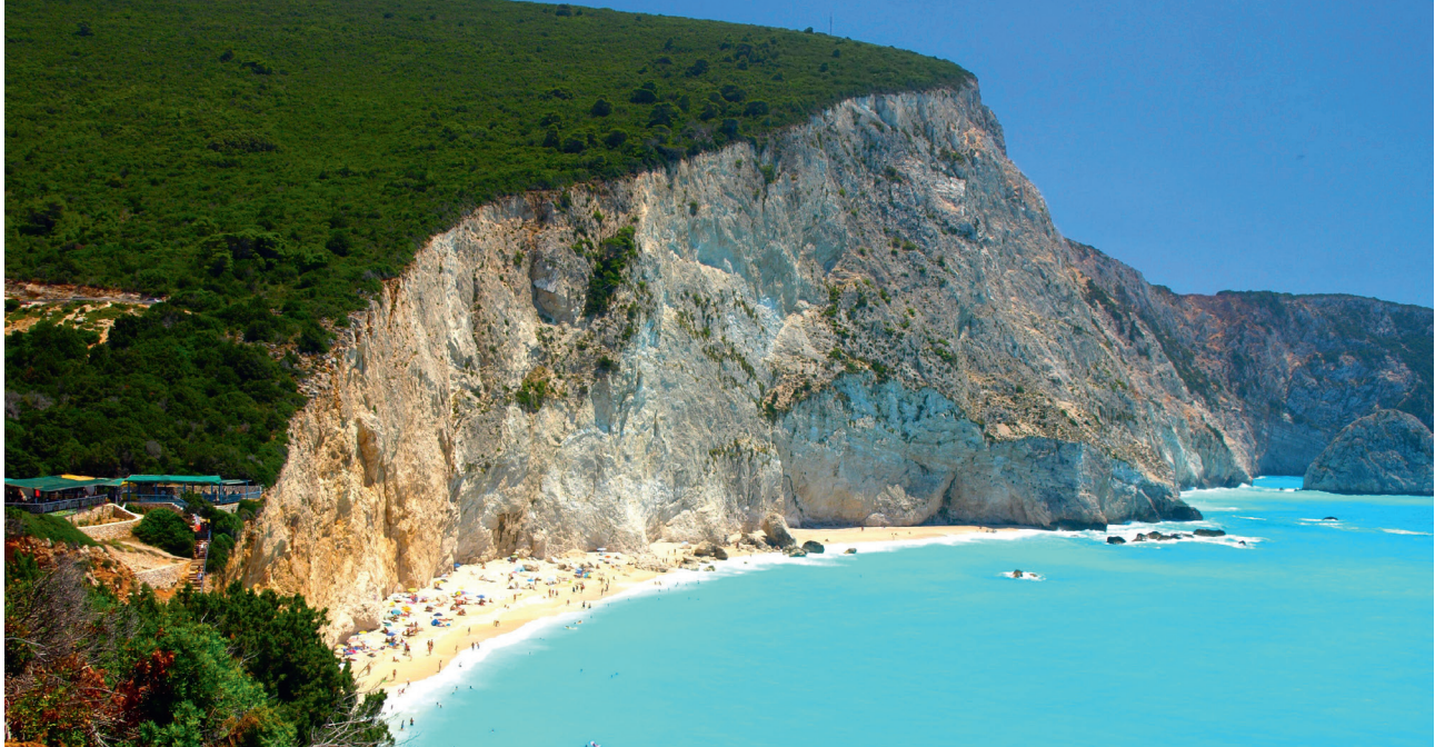
A view of the idyllic Porto Katsiki.