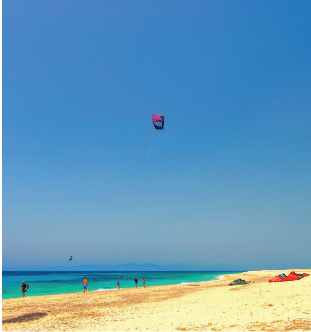
The beach of Agios Ioannis.