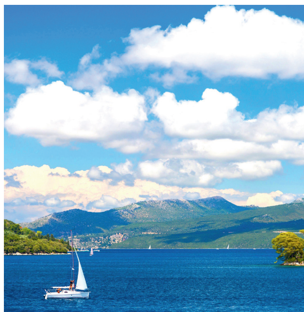
By the harbour of Nidri.

One of the two main ports of the island and located on the southern coast of the island is bustling resort of Vassiliki - a windsurfer's heaven! The town is quite small but very international and often full of bronzed surfers with sun bleached hair. If you want to race across the bay on something a bit more stable, there are dinghy sailing clubs with everything from Mirrors up to Lasers and Hobicats. These often overtake the old ferry as it sails across from Kefalonia! Don't come for the beach alone, the main attraction here is the wind; steady and gentle in the morning and perfect for beginners, it builds up in the afternoon to give the true aficionados a creaming ride across the waves. There is also a wide range of other watersports available such as ringos, banana boats, waterskiing and jet ski from the beach.