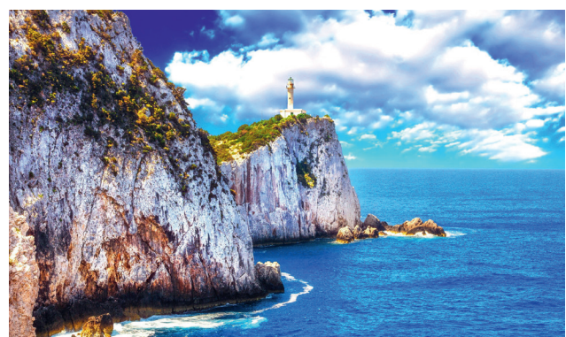
Sappho's leap, Lefkatas.

Located in the south of Lefkada – the most southerly cape on the island – Lefkatas, or else Sappho's Leap, is admittedly a sightseeing highlight. This is the spot where Sappho, the lyric poet, took her life by jumping off the cliff and into the sea. Sappho decided to give an end to her suffering of her unrequited love for Phaona.