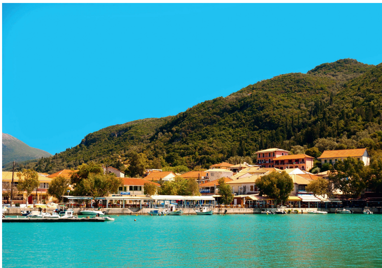
The beautiful village of Vassiliki.

which passes through a small selection of tavernas and shops, although the island's bus service does stop by this beach also.