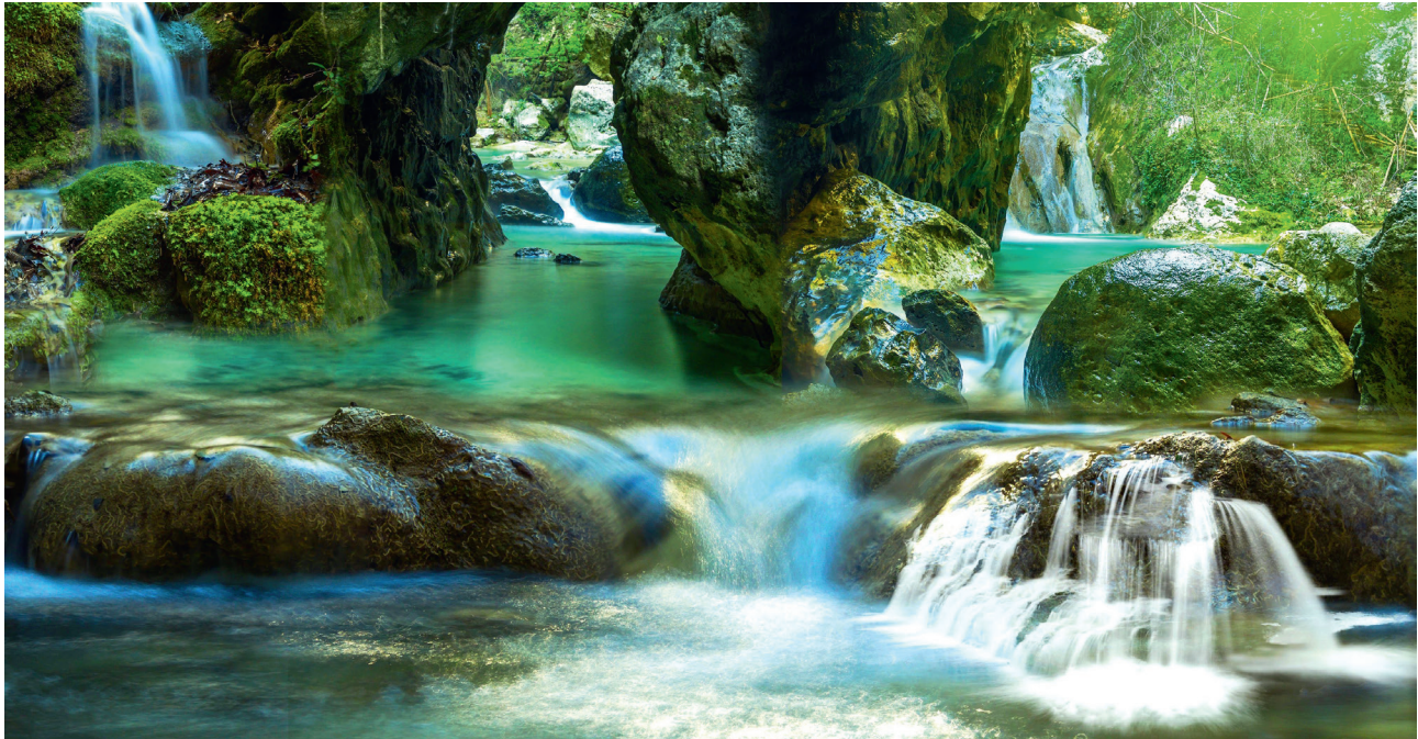
Near Nidri, the waterfalls of Dimossari are a popular tourist attraction.