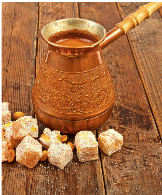
Greek coffee is boiled in a pot.

There are lovers and there are haters. People who have tried the Greek coffee, also known as Turkish although you are better off ordering it as 'Greek', have either fallen in love with its strong coffee smell and thick texture or have found it hard to even get a sip off the cup. Order this unfiltered coffee with a spoon of sugar, otherwise you will be joining the haters in no time. Complement your Greek coffee with some pastries from the local bakery.