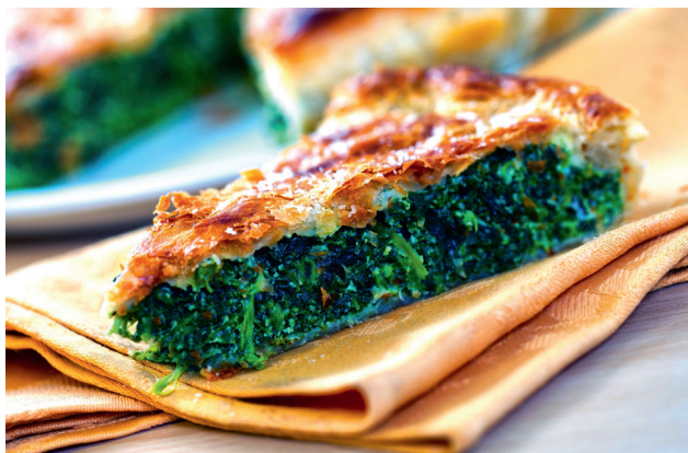
The trademark Spinach Pie.

The Spinach pie is the trademark delicacy of Greece. Homemade crust, filled with feta cheese and spinach.