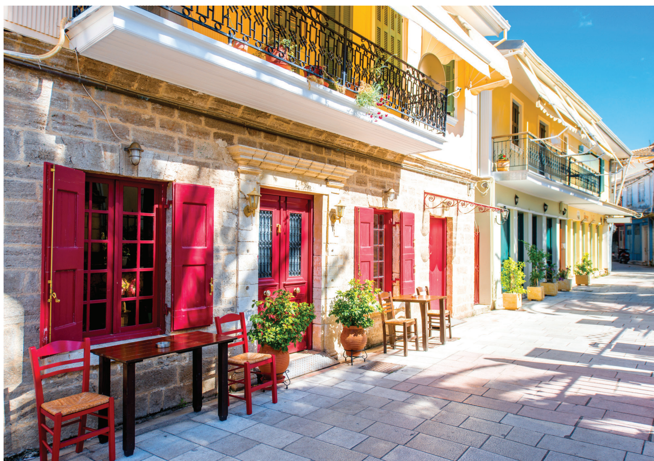
Colourful houses in the Island's capital, Lefkada Town.