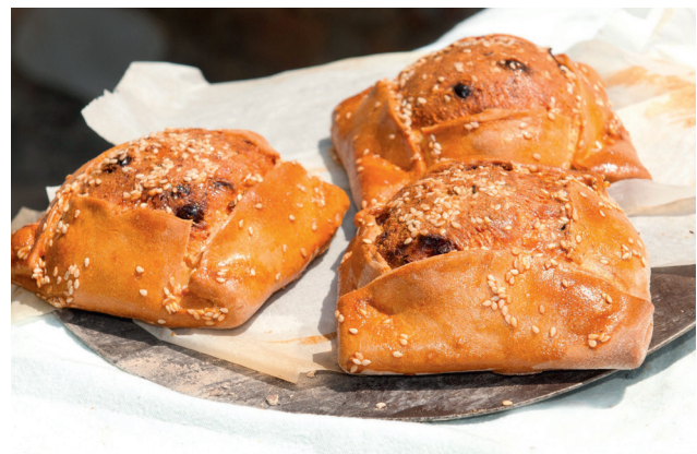
Freshly baked Flaounas.

Mainly an Easter pastry, Flaouna is cheese filled dough with raising and sesame seeds. The making of the Flaouna, normally prepared on a Good Friday and eaten on the Sunday, is usually a family 'team effort' with the children helping their parents as sous-chefs.