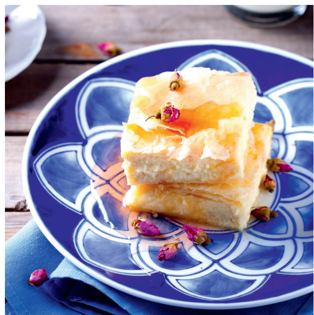
The very fine Aliada dish.

For the majority of Greeks, Galaktoboureko is the tastiest sweet in the country. Made of home made pastry and custard filling with eggs, milk and sugar, Galaktoboureko resembles the French mille-feuille. Unlike the French delicacy though, in this instance, the custard is baked with the pastry.