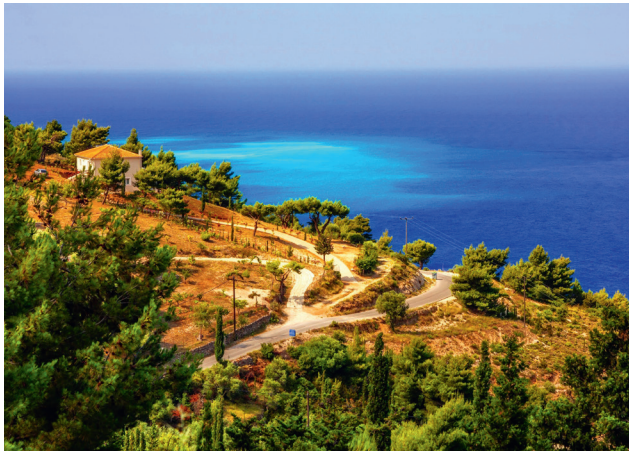
A rural landscape in Lefkada.

The town however, is essentially a harbour town, and it is possible to take many trips to other islands and around Lefkada, and one of the most popular boat trips from the port is a full day visiting Skorprios, Meganisi and its caves, and the inner islands near the coast. For the less adventurous, the harbour in Nidri is often full of impressive yachts, and it's a great place for armchair sailors to sit and watch the world go by at one of the many waterfront tavernas.