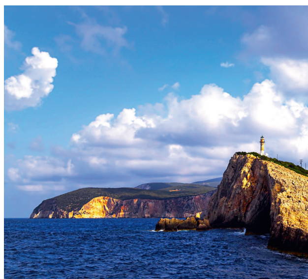
View of the lighthouse in Lefkatas.

boasts a huge stretch of golden sand which reached south along the west coast as far as Kalamitsi, the next town, although visitors tend to remain around the Northern end of the beach where a small selection of tavernas are located. Kathisma has little natural shade so it might be worth taking a beach umbrella.