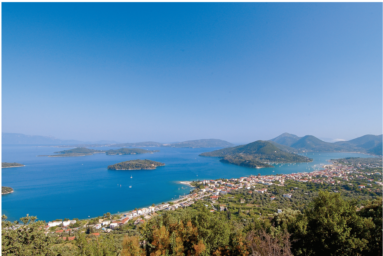
A panoramic view of Nidri.

Should you book two holidays with us in the same season at full brochure price, we will reduce the cost of your second holiday by 15%.