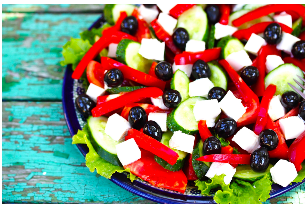
A healthy choice

During the hot summer days, you can't go wrong with a refreshing Greek salad. You can even have it as your main course. Why not throw some grilled meat on the side?