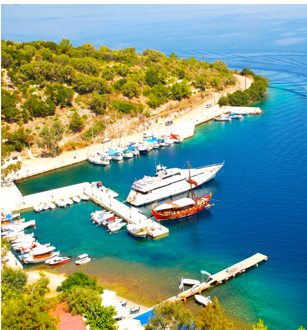
View of Spilia bay from Spartochori

Walking is excellent on the island and the only real method of travel to truly reveal