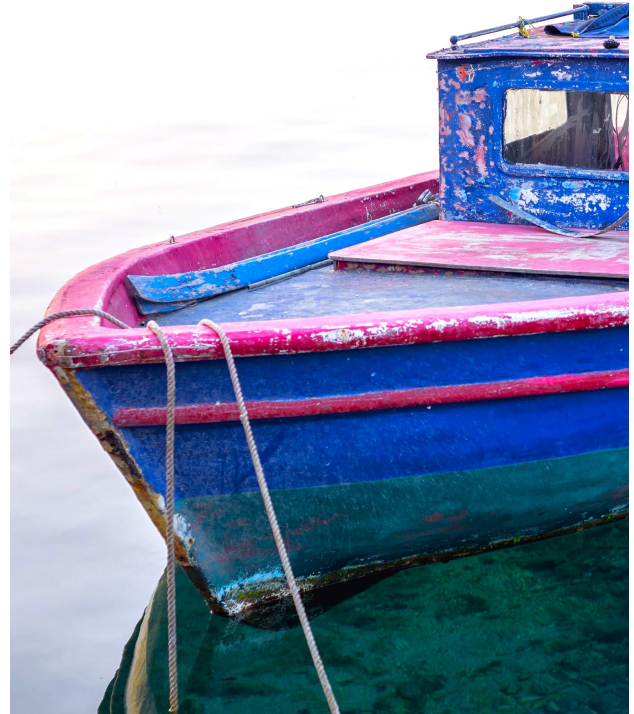
Many fishing boats moor in Vathi

Vathi has a selection of waterfront tavernas and cafes from which to watch the action in the harbour, and one or two have an excellent choice of freshly caught seafood dishes. Vathi is a good choice for an evening out, being easily accessible from the hotel in around 10 minutes stroll downhill - although don't forget that you will need to walk back up again to get home!