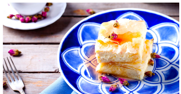
A delicious Greek version of the French mille-feuille

For the majority of Greeks, Galaktoboureko is the tastiest sweet in the country. Made of home made pastry and custard filling with eggs, milk and sugar, Galaktoboureko resembles the French mille-feuille. Unlike the French delicacy though, in this instance, the custard is baked with the pastry.