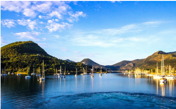
View from the harbour of Vathi

The largest of Meganisi's two ports, Vathi is a charming and traditional fishing village, flanked with churches originally erected to bless all boats with safe passage to and from the island. Not much has changed here for hundreds of years and the main action still revolves around the arrival and departure of the daily ferry from Nidri to Lefkada.