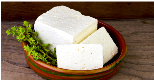
A refreshing block of Feta

Made of sheep's and goat's milk and produced in blocks, feta is the most popular Greek cheese used in lots of Greek dishes, salads and even pastries. High quality feta should have the aroma of ewe's milk, yoghurt and butter, together with a smooth and thick texture.