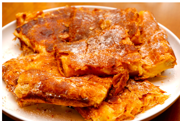
The sweet and creamy Bougatsa

warm Bougatsa. In most bakeries you will be offered the savoury version of the pastry as well. You can find the Bougatsa where in place of custard, the pie will be filled with cheese or minced meat.