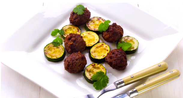
Known as 'kolokythokeftedes'

These lightly fried balls are certainly among the most popular starters on the Greek table - usually paired with some freshly made tzatziki.