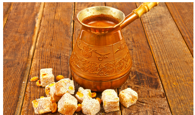
Greek coffee in a pot

There is lovers and there is haters. People who have tried the Greek coffee, also known as Turkish - although you are better off ordering it as 'Greek' - have either fallen in love with its strong coffee smell and thick texture or have found it hard to even get a sip off the cup. Order this unfiltered coffee with a spoon of sugar, otherwise you will be joining the haters in no time.