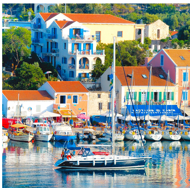
Our home in Kefalonia

We believe that people who book with Ionian Island Holidays will benefit from our experience, knowledge and the personal attention that we, as a small independent tour operator, can offer. When you contact our office in London, you will be speaking to an experienced and knowledgeable team who know the islands and the accommodation intimately.