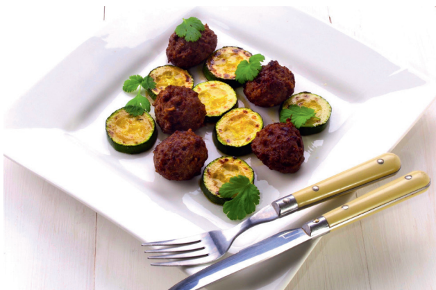
Gourgette balls, known as 'kolokythokeftedes'.

These lightly fried balls are certainly among the most popular starters on the Greek table - usually paired with some freshly made tzatziki.