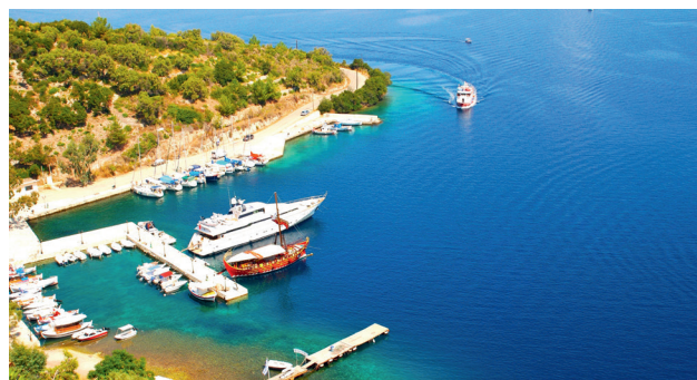
View of Spilia bay from Spartochori.

This clean, pebbly beach is surrounded by greenery offering natural shade. It's located at the far end of Spartochori bay and there you will find a few Greek tavernas to enjoy traditional dishes. From the village of Spartochori you can enjoy a beautiful view of the entire bay.