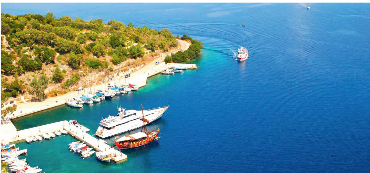
View of Spilia bay from Spartochori.

Mythology tells us that King Tafios, a son of Poseidon, was the founder of the town of Tafion. Later, according to Homer's Odyssey, Ulysses gave his fleet to Mentor, the Tafion king at the time, when he left for Troy. Tafion is the island we now know as Meganisi. He would no doubt be comforted to see that there have not been a lot of changes to his beloved island since he was last there!