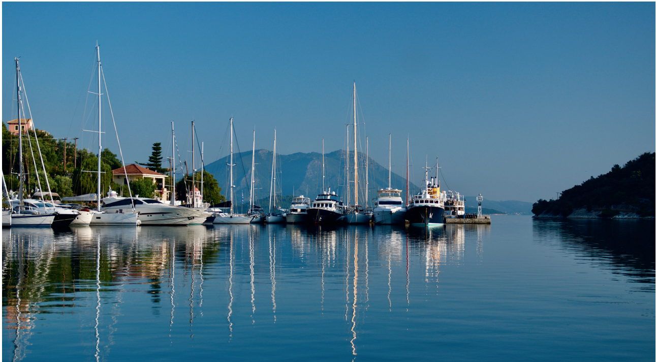
The port of Vathi.

There are a number of beaches within walking distance of our accommodation. Spilia, close to the little port of Spartochori has a pebble strand, Ambelakia on the north coast is one of a string of beaches that can be reached by walking. Alternatively, caiques from Vathi can be taken there.