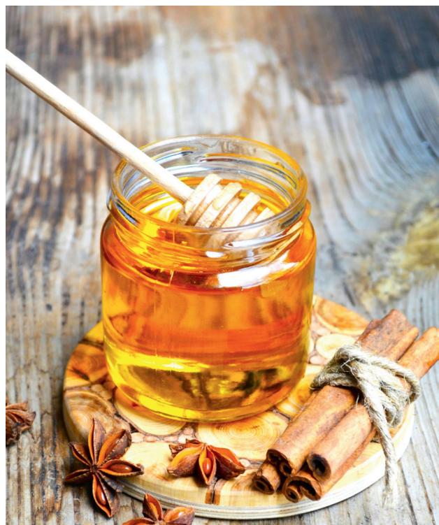
Locally produced honey.

The country produces its own high quality and exceptionally tasty honey. The geography's biodiversity and environmental state promote the yield of such unique produce.