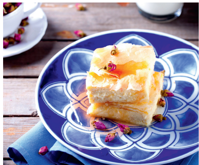
The very fine Aliada dish.

For the majority of Greeks, Galaktoboureko is the tastiest sweet in the country. Made of home made pastry and custard filling with eggs, milk and sugar, Galaktoboureko resembles the French mille-feuille. Unlike the French delicacy though, in this instance, the custard is baked with the pastry.