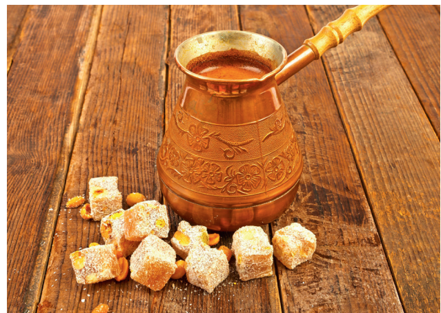
Greek coffee in a pot.

There are lovers and there are haters. People who have tried the Greek coffee, also known as Turkish - although you are better off ordering it as 'Greek' - have either fallen in love with its strong coffee smell and thick texture or have found it hard to even get a sip off the cup. Order this unfiltered coffee with a spoon of sugar, otherwise you will be joining the haters in no time.