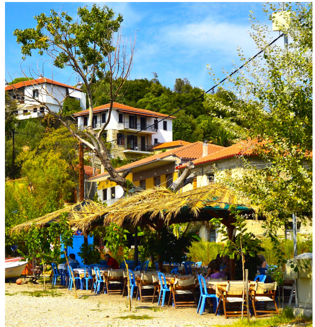
By the beach

energetic enough there is a footpath beside the line that can be followed all the way back to the coast! Further into the mountains, half hidden amongst the chestnut and cherry trees, you will find equally historic settlements, some with small, local museums full of artifacts and displays of the Pelion's colourful history.