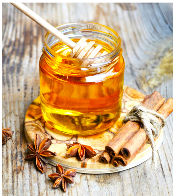
Locally produced honey

The country produces its own high quality - and of exceptional taste - honey. The geography's biodiversity and environmental state promote the yield of such unique produce.