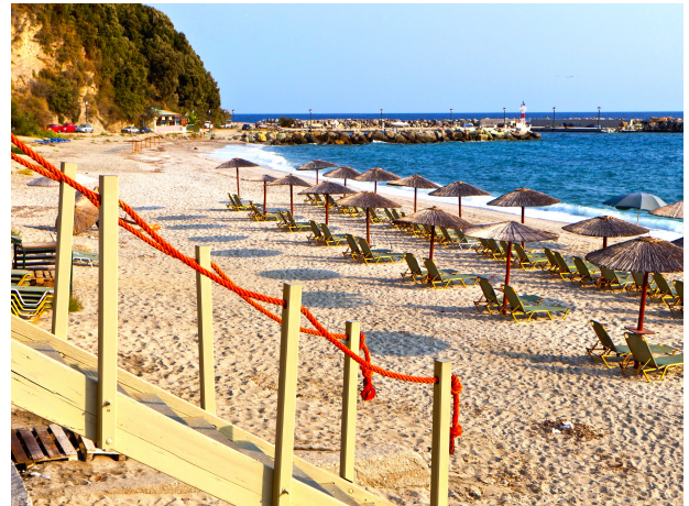
Agios Ioannis beach

This popular coastal town has a large sandy beach.